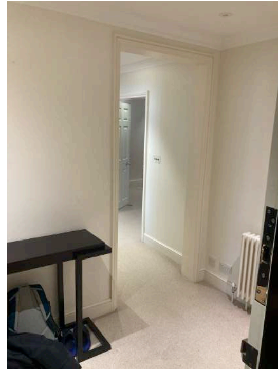
B PHOTO B Entrance Hallway looking towards main Hallway.