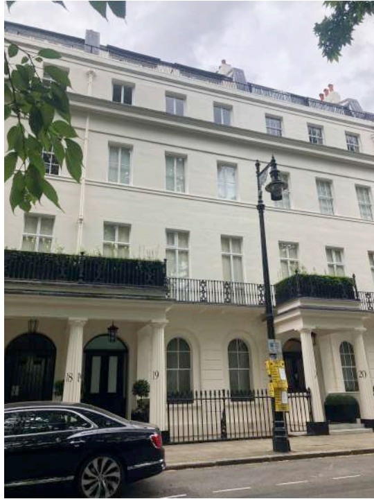
A PHOTO A View from Eaton Square looking towards 18-20 Eaton Square.