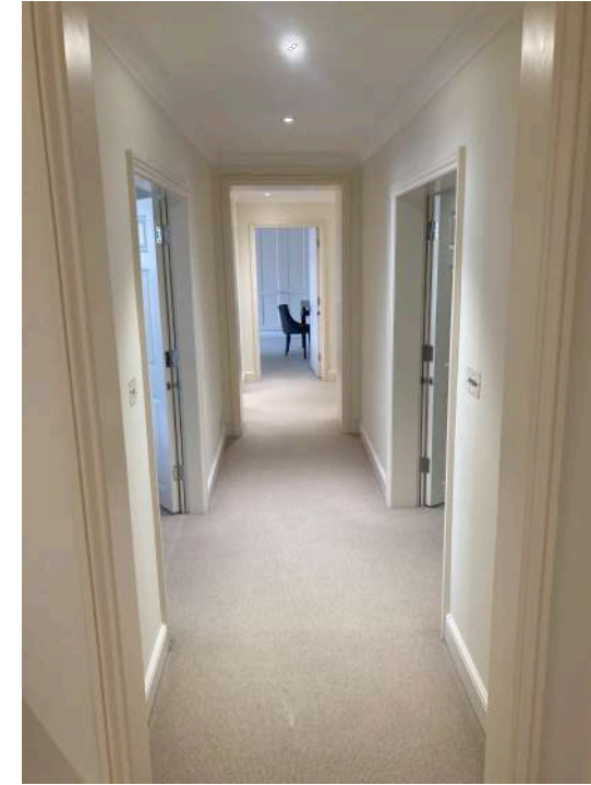
D PHOTO D Hallway looking down towards Master Bedroom.