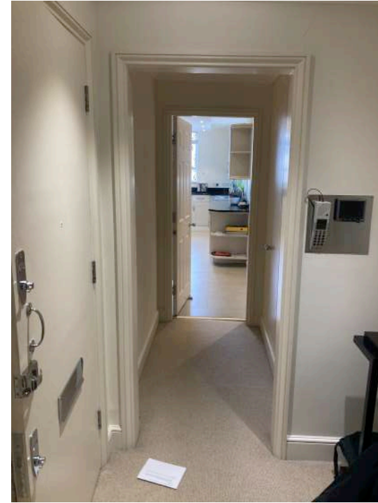
C PHOTO C Entrance Hallway looking towards Kitchen.