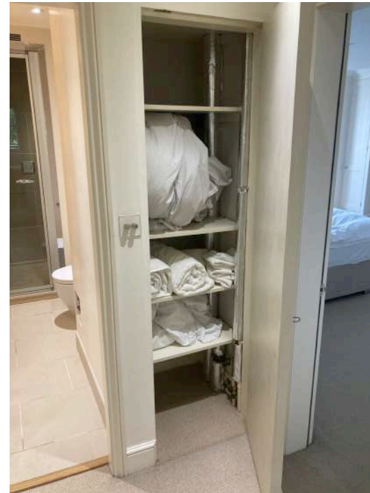
F PHOTO F Cupboard off Hall with service pipework visible.