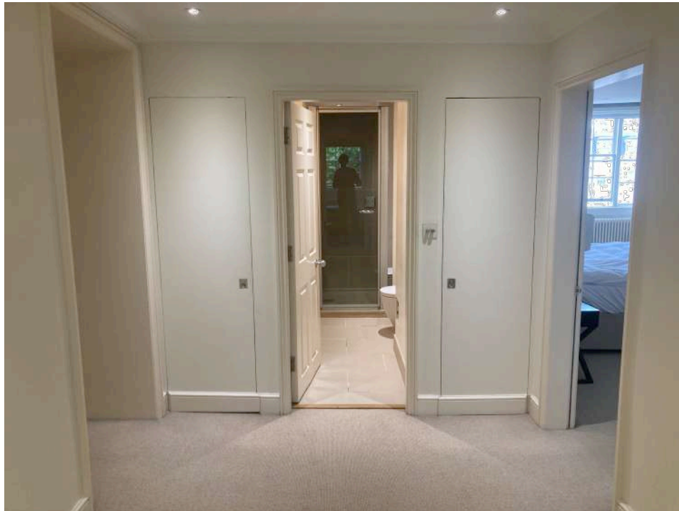
E PHOTO E Hall with Bathroom 2 entrance shown ahead and Master Bedroom entrance to the right hand side.