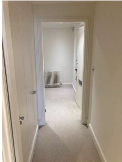
G PHOTO G From Kitchen looking at the Store Room towards entrance door of the flat.