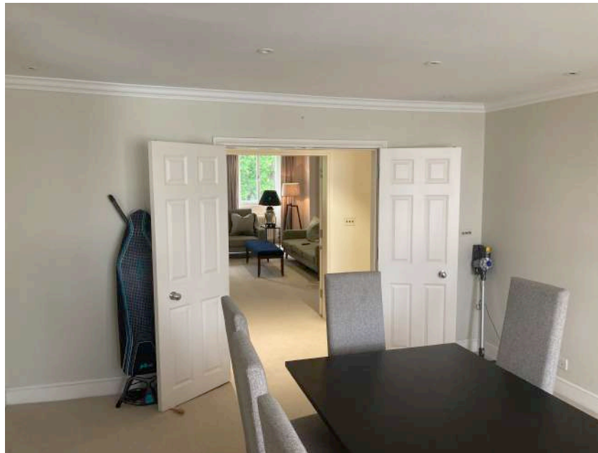
L PHOTO L Dining Room looking towards Hallway and Living Room beyond.