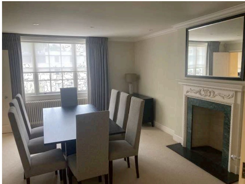
K PHOTO K Dining Room.