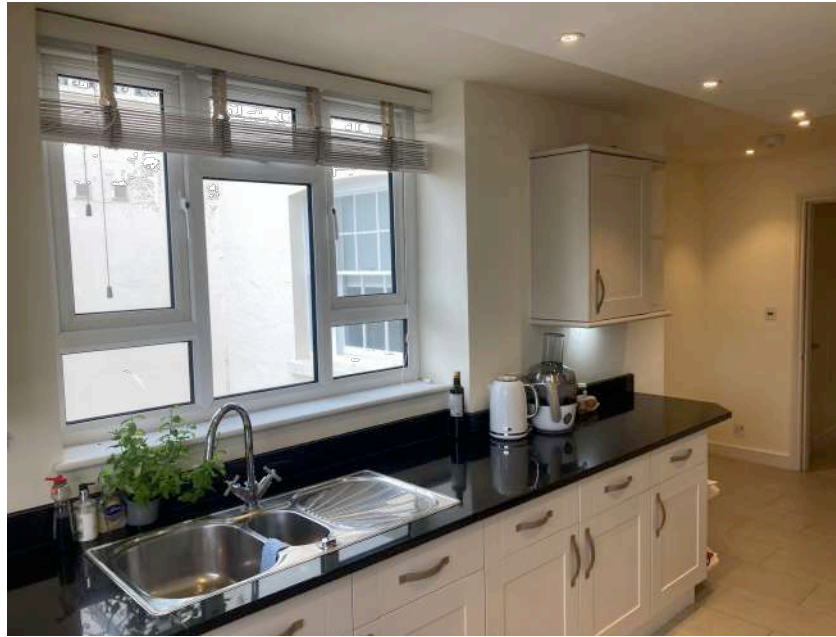
I PHOTO I Kitchen side window and sink area.