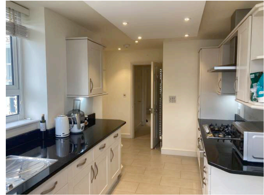
J PHOTO J Kitchen looking back towards Store Room door.