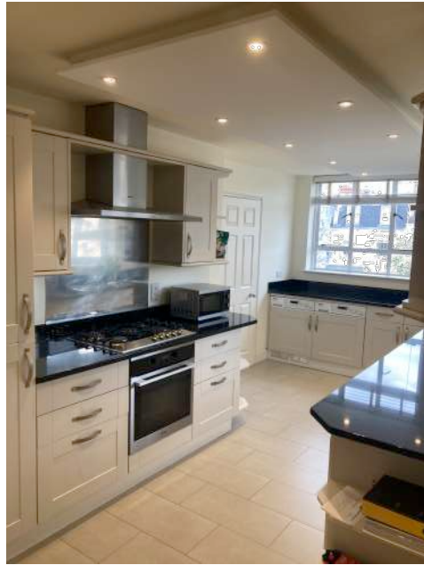
H PHOTO H Kitchen with rear window and boiler cupboard door beyond.