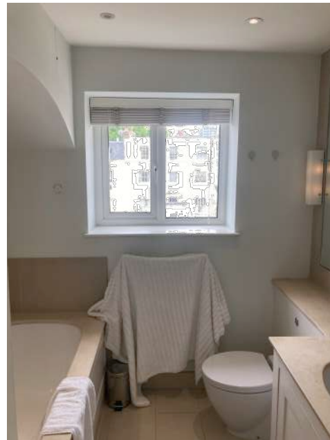
PHOTO W W Master Bathroom.