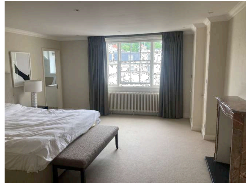
PHOTO U U Master Bedroom.