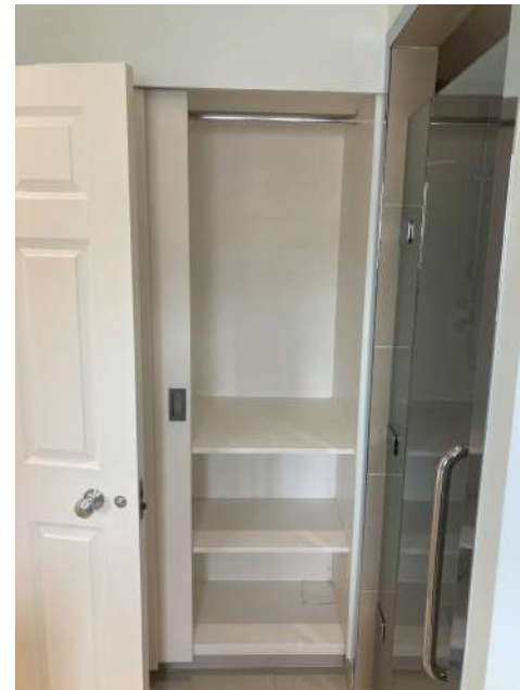
PHOTO X X Master Bathroom with shower on the right hand side.