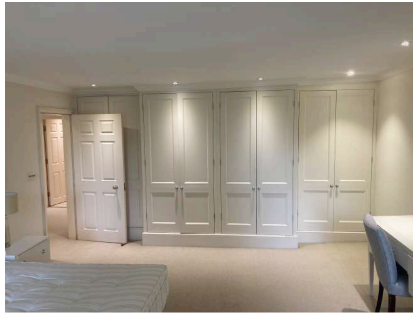
PHOTO T T Bedroom 2 looking towards existing modern wardrobe.