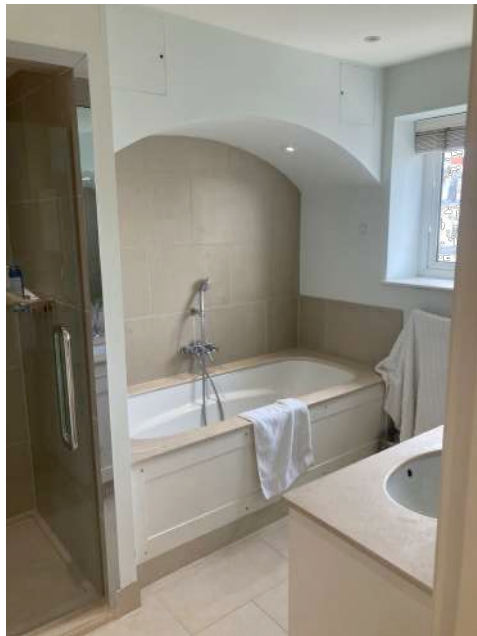
PHOTO V V Master Bathroom with modern non-original boxing out above bath.