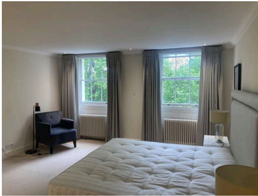
PHOTO S S Bedroom 2.