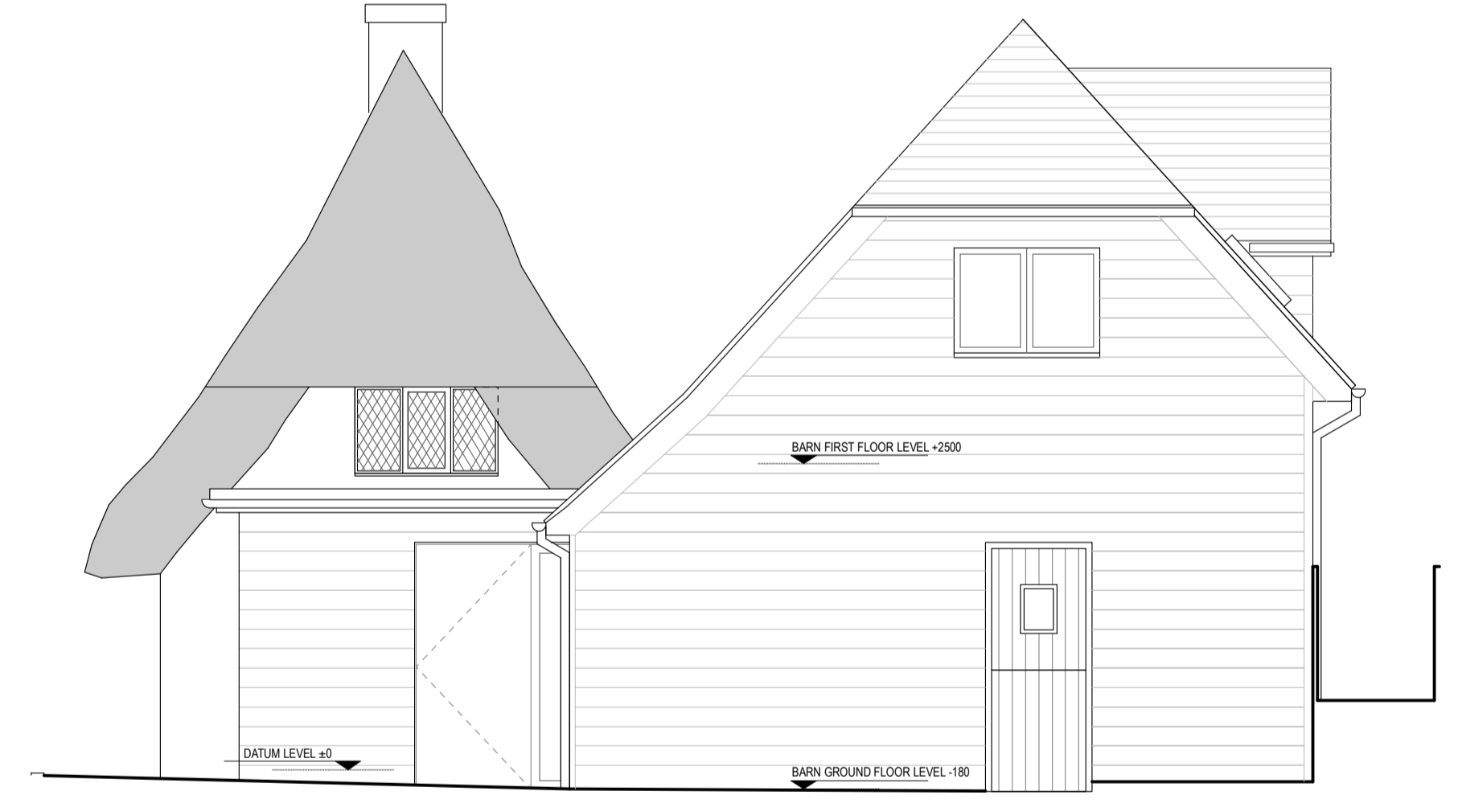
EXISTING NORTH SIDE ELEVATION

1. This is an 'Existing Drawing' based on an 'Outline Survey' which shows aspects of the property as it is prior to any new proposals and should be read alongside the 'proposed' drawings. 2. This drawing has been based upon rough survey measurements that were taken for OUTLINE DESIGN PURPOSES ONLY and is NOT likely to be as precise as a full measured survey. As a result, no warrant as to the precision of the dimensions indicated or illustrated can be given or should be inferred. 3. This drawing is intended to form part of a Planning Application only and is not suitable for construction.