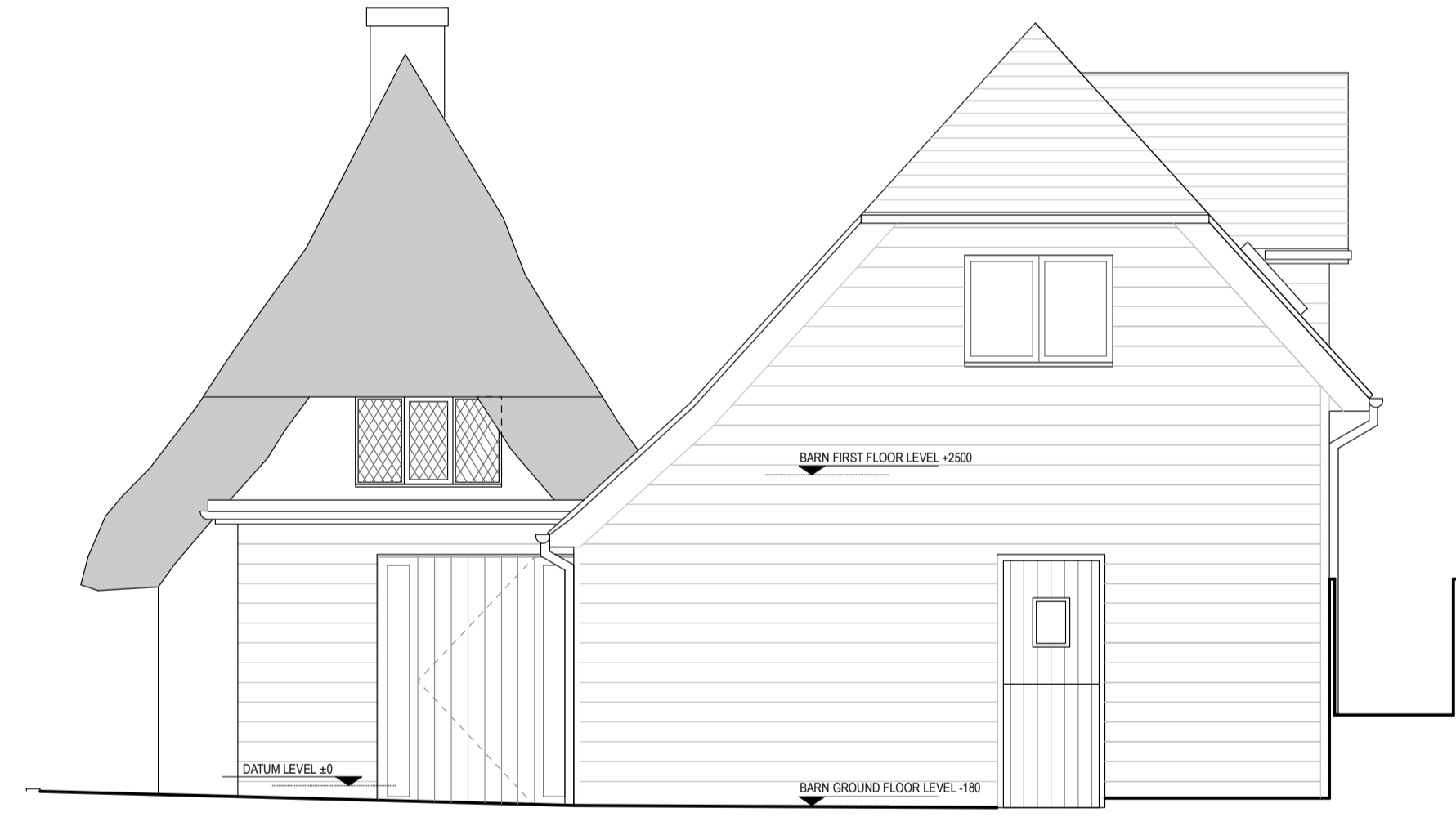
PROPOSED NORTH SIDE ELEVATION