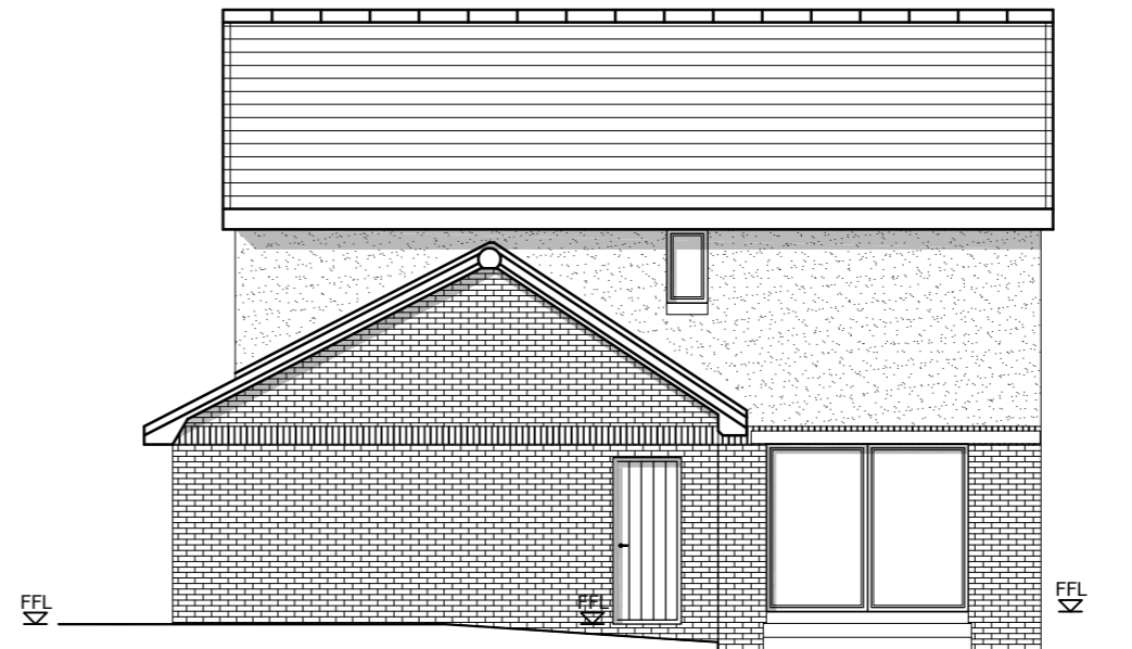
Existing Side Elevation Scale 1:100