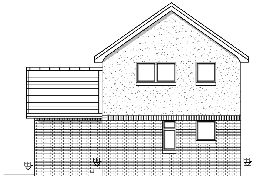
Existing Rear Elevation Scale 1:100

9 MONTGOMERY STREET THE VILLAGE EAST KILBRIDE GLASGOW G74 4JS TEL : 01355 260909 HELLO@DTA.SCOT