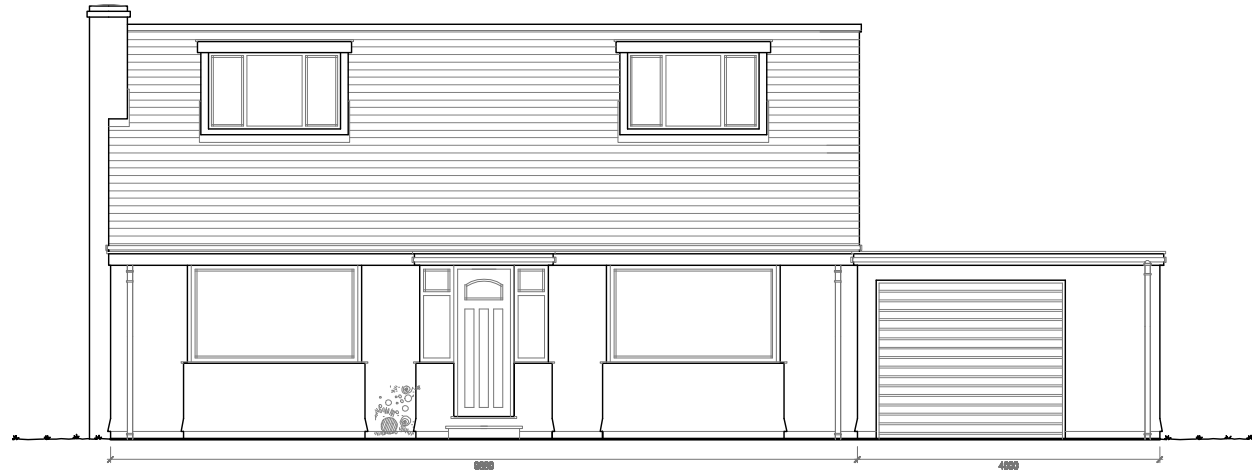
3b Proposed Front Elevation Scale: 1:100