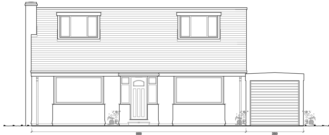
3a Existing Front Elevation Scale: 1:100