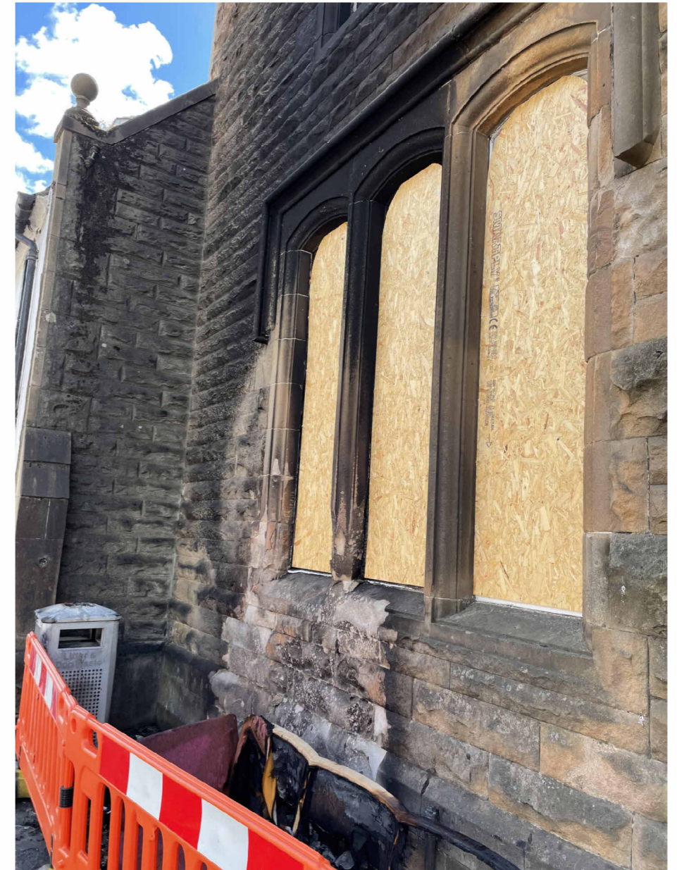
IMAGE SHOWING EXTENT OF DAMAGE