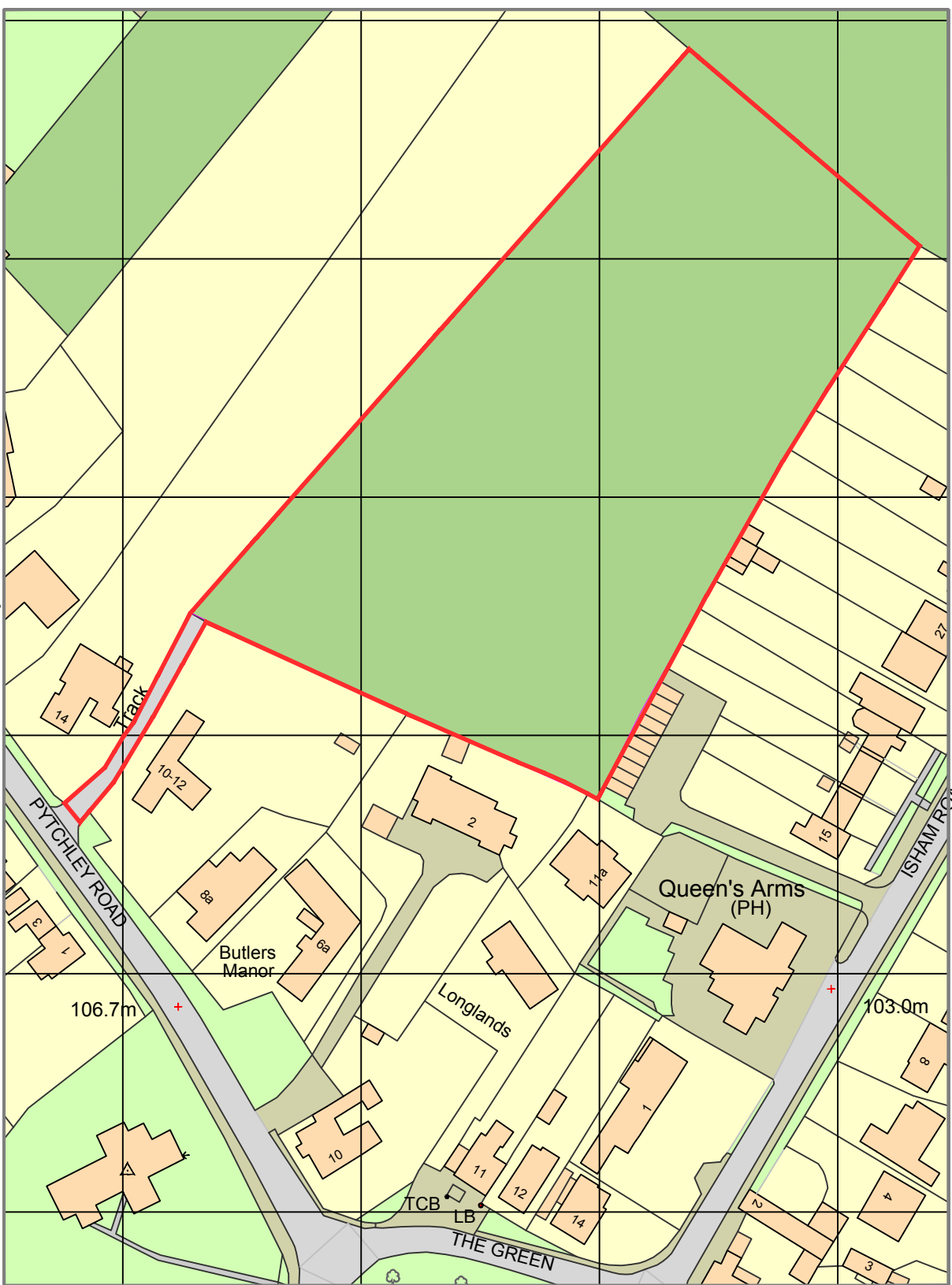
SITE LOCATION PLAN 1:1250@A3