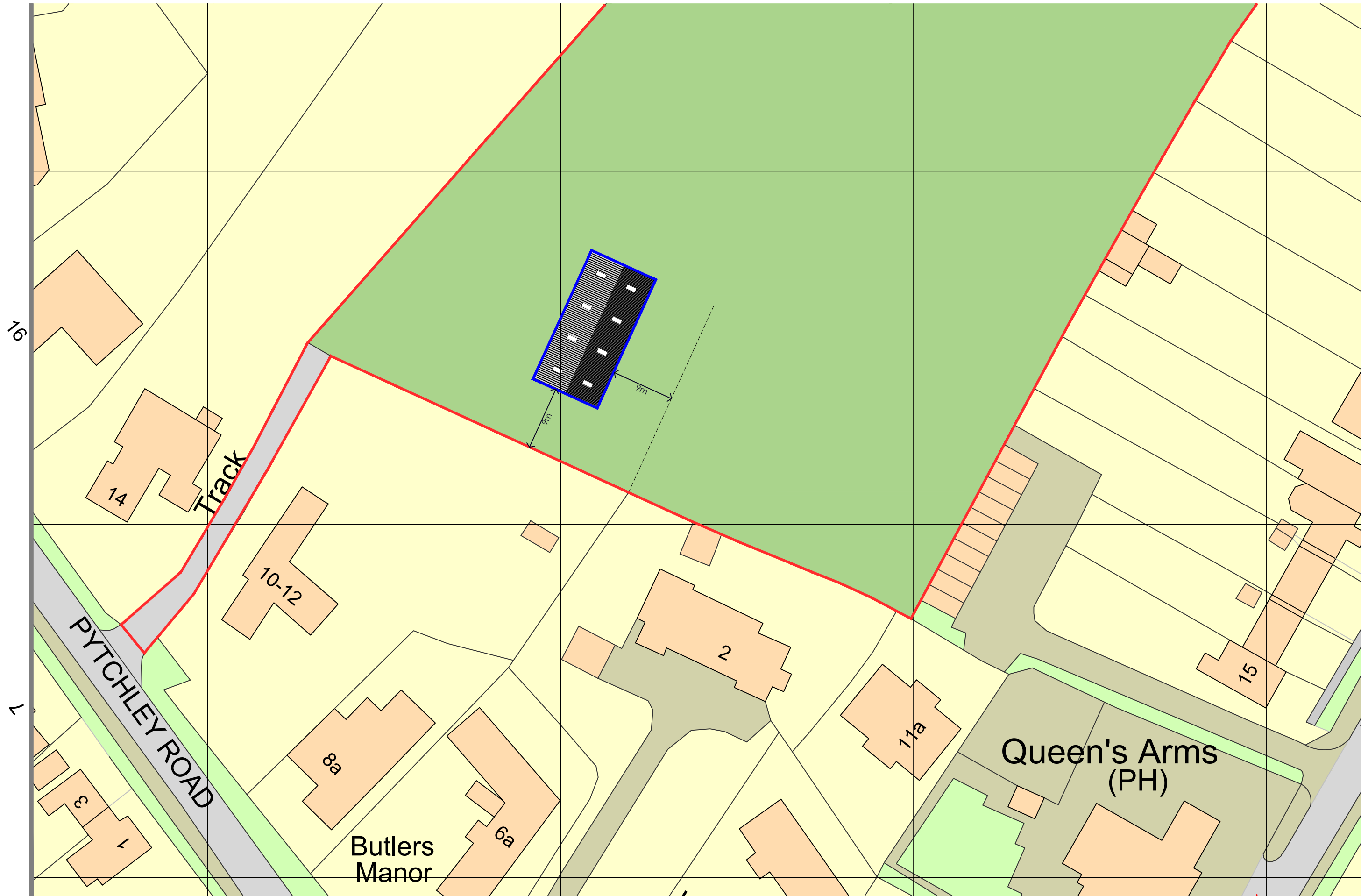
PROPOSED BLOCK PLAN 1:500@A3

— Denotes Site Boundary — Denotes Extent Of Works