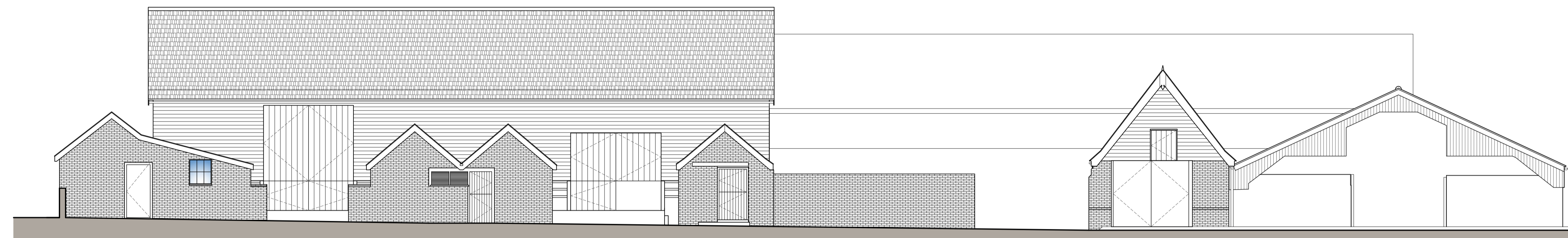
existing elevation J (south)