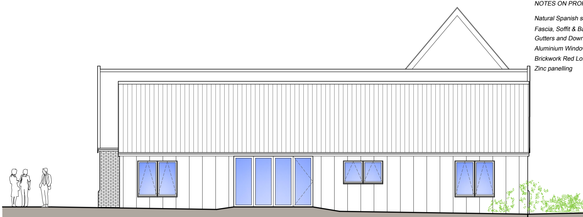
plot 1 proposed elevation A (east)

NOTES ON PROPOSED MATERIALS: Natural Spanish slate roof existing pitch Fascia, Soffit & Bargeboards stained Black Gutters and Downpipes, Upvc colour: Black Aluminium Windows & Doors, colour: dark grey Brickwork Red London Stock base of zinc panels laid Flemish, white mortar Zinc panelling