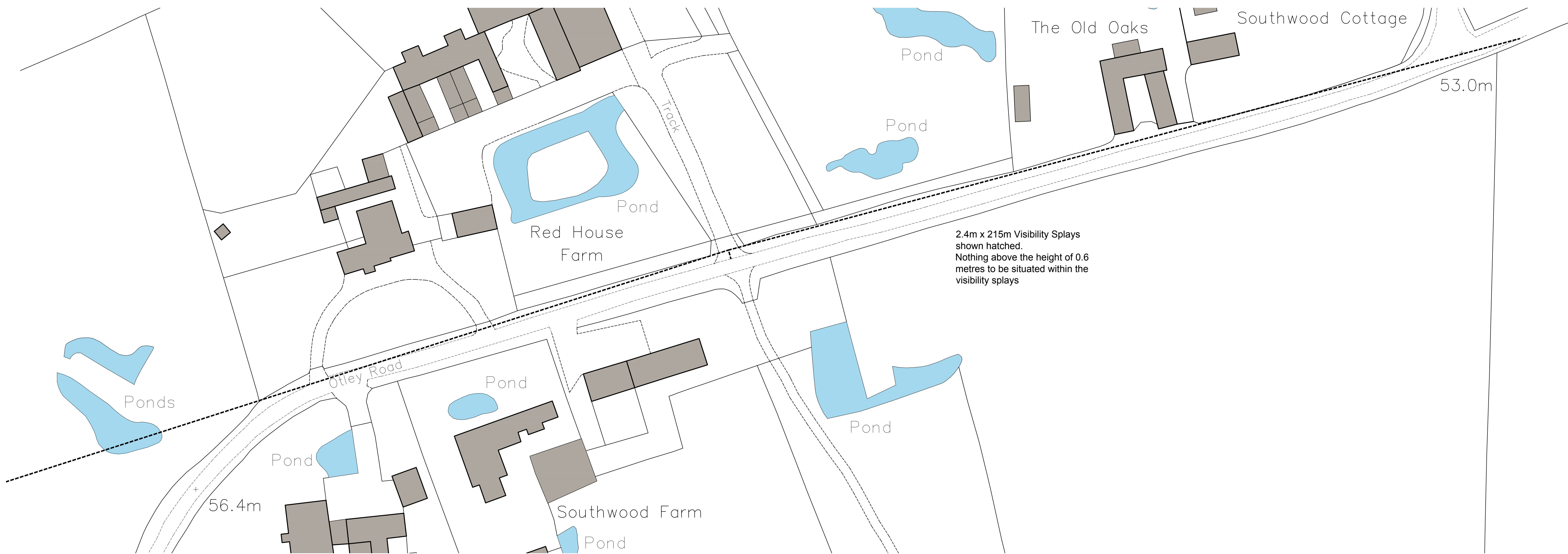
Visibility Splays 1:500