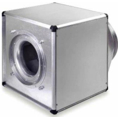
Table 5.1 – Manufacturer supplied Sound power level