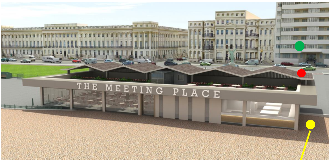
Figure 5.2 – Plant Location

The closest noise sensitive receiver to the installation location of the plant has been identified as being a residential window located approximately 87 meters from the proposed location of the extraction outlet as shown in Figure 5.2.