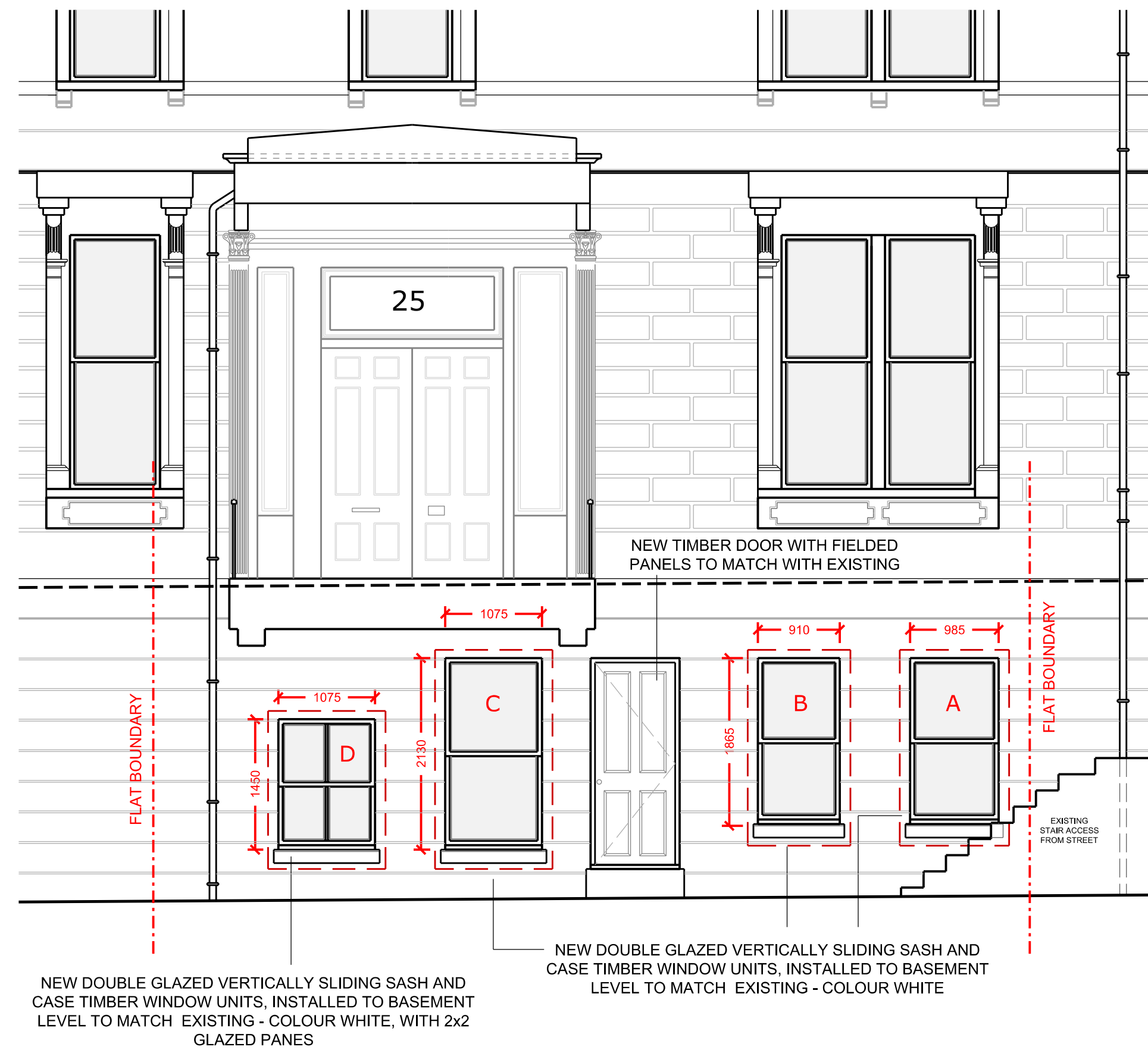
FRONT ELEVATION as EXISTING/ PROPOSED SCALE - 1:50

Ground Floor Level (Datum) 0.000mm Ground Line -0.320mm Basement Ceiling Height -0.820mm Street Level -1.475mm Basement Floor Level -3.525mm Basement Ground Line -3.840mm