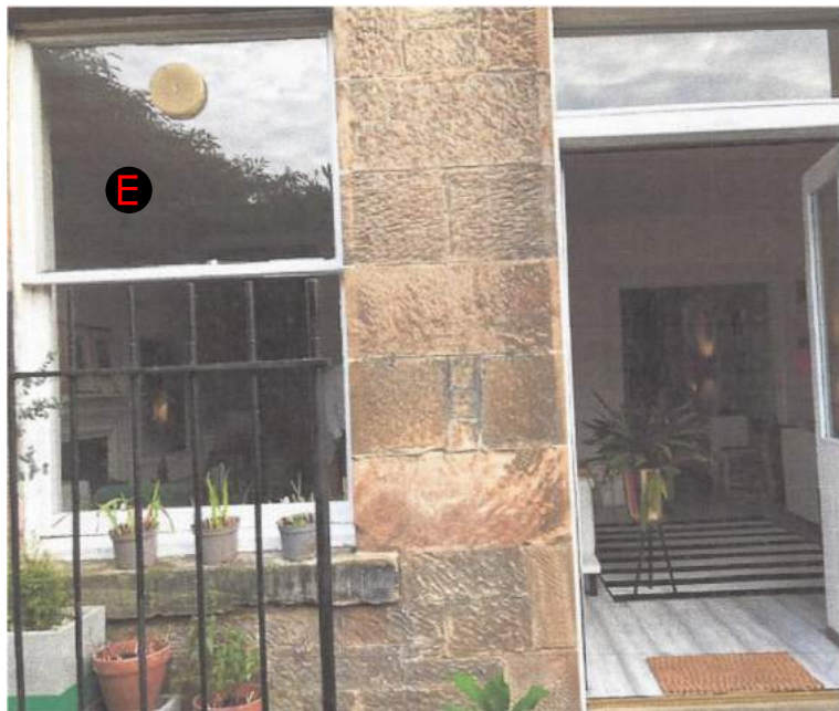
EXISTING WINDOW REAR ELEVATION

Ground Floor Level (Datum) 0.000mm Ground Line -0.320mm Basement Ceiling Height -0.820mm Street Level -1.475mm Basement Floor Level -3.525mm Basement Ground Line -3.840mm