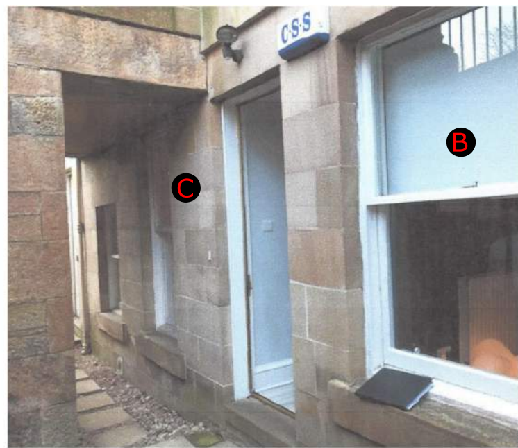
EXISTING WINDOWS FRONT ELEVATION