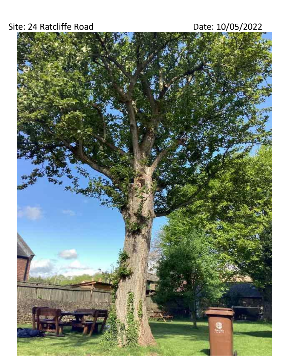
T1 -Populus Spp