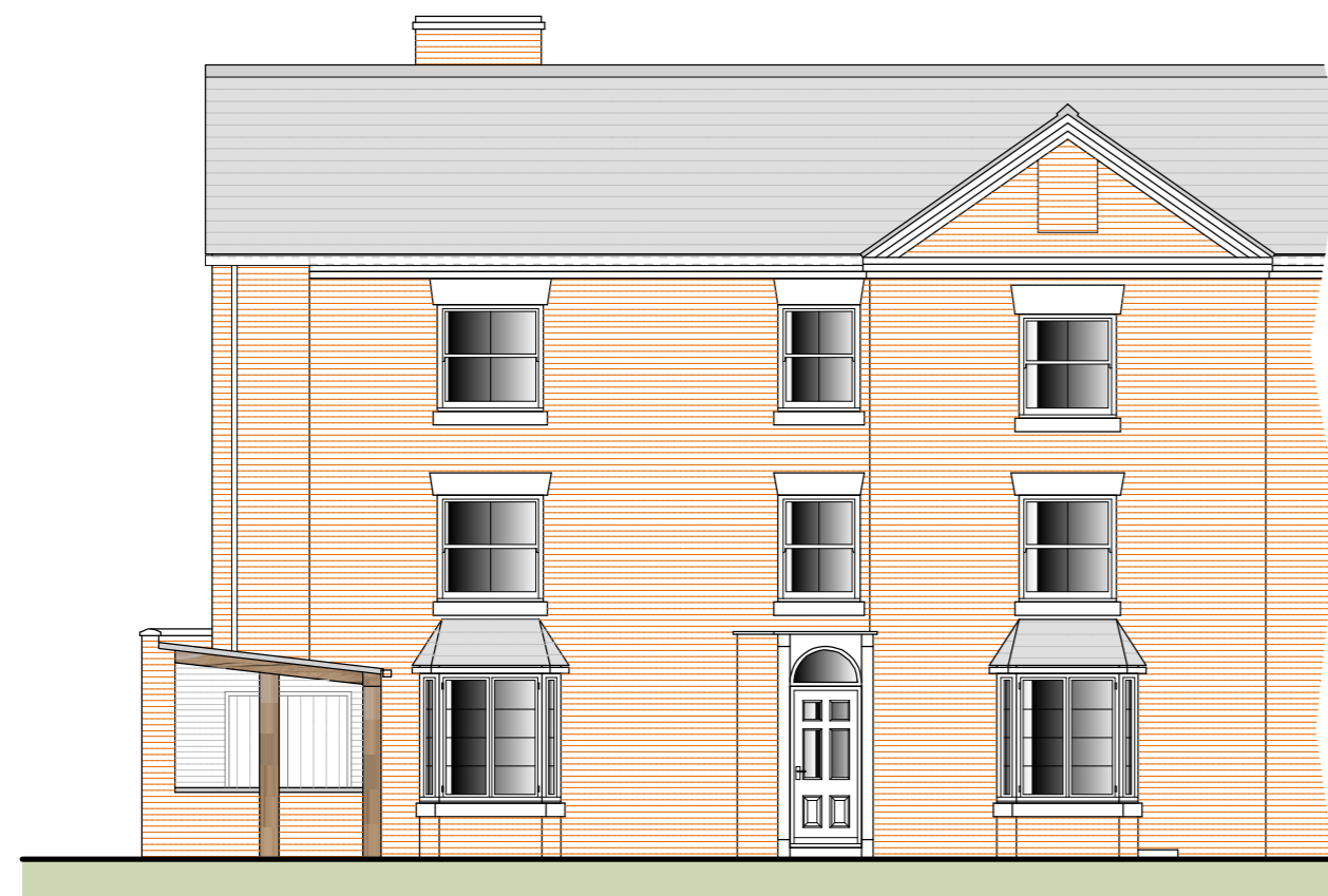
3 PROPOSED SOUTH-WEST (REAR) ELEVATION 1 : 100