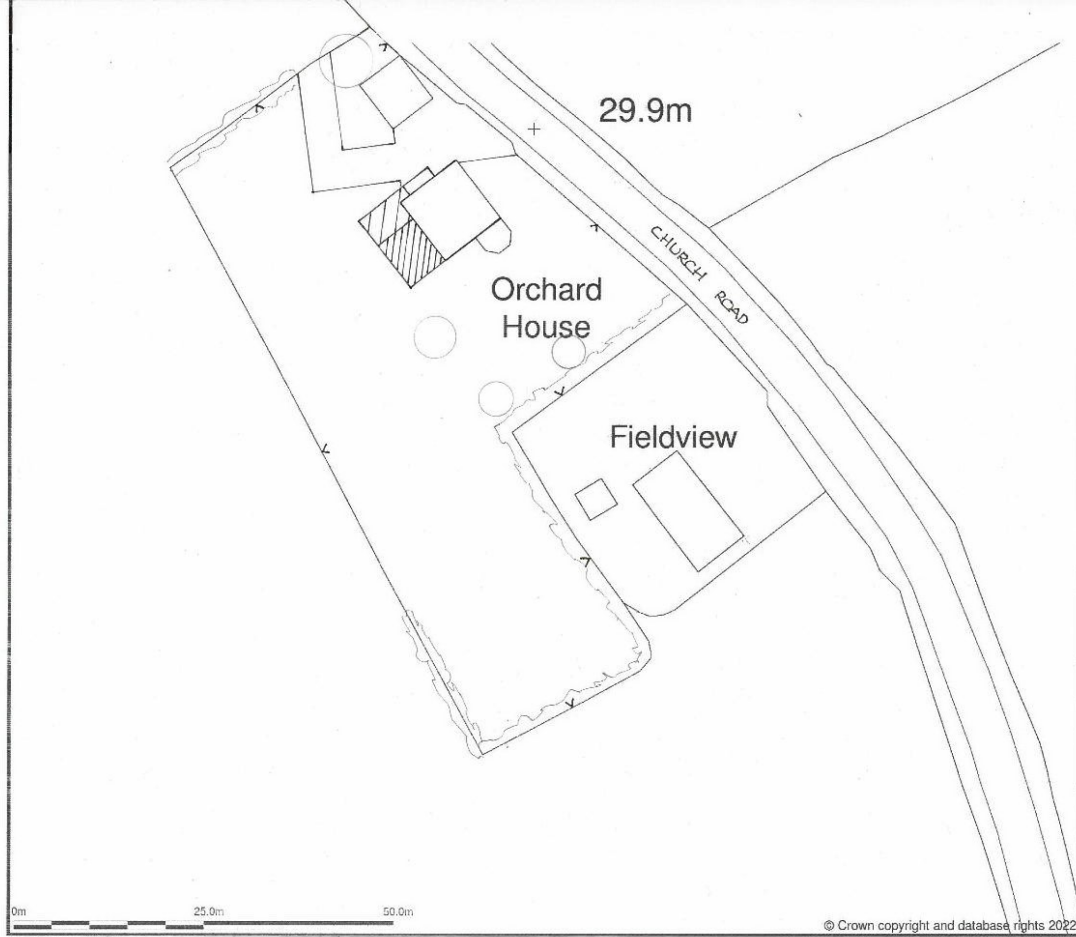
SITE PLAN 1:500 Site boundary marked with arrows Development area shown hatched