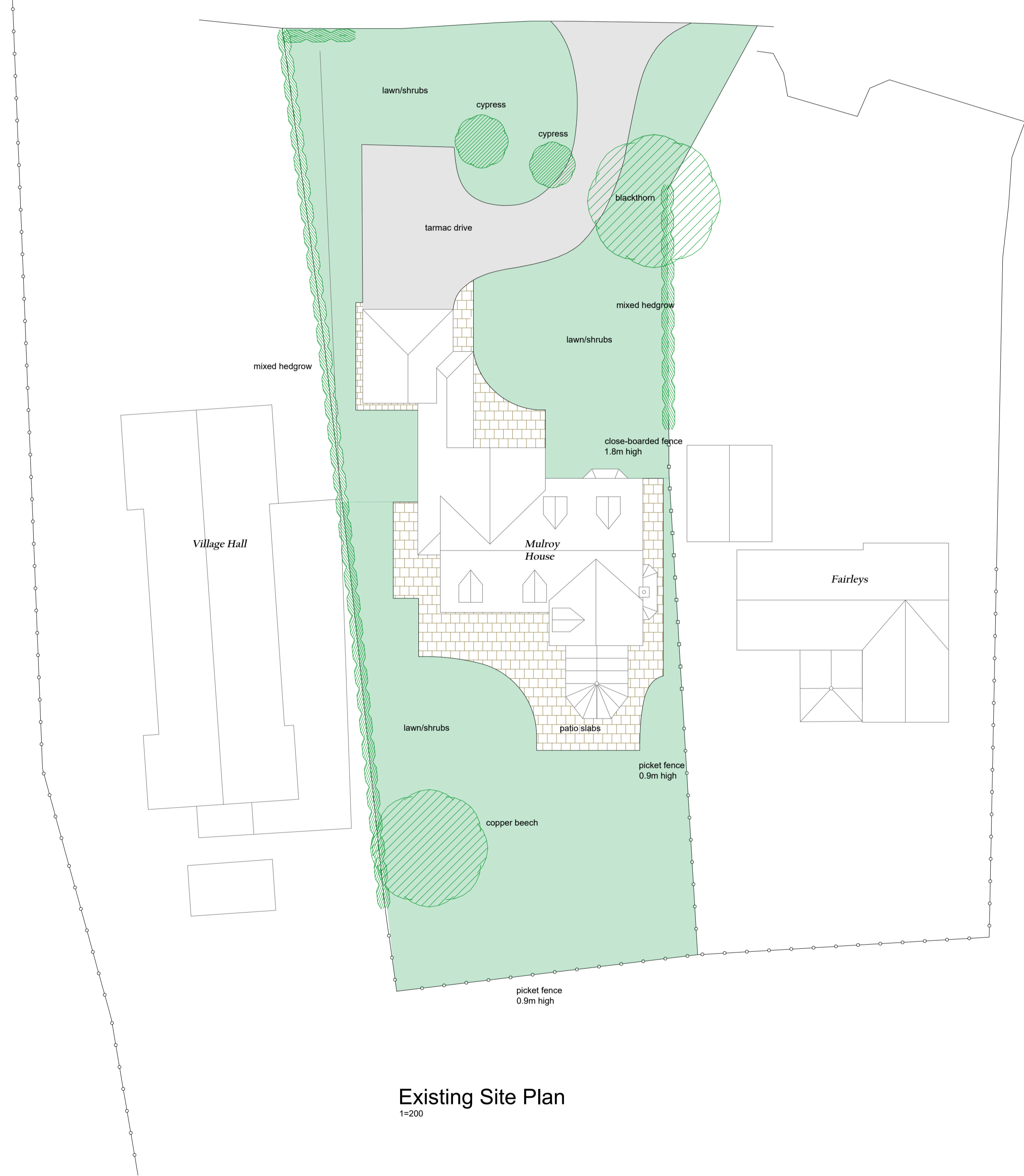
Existing Site Plan 1=200