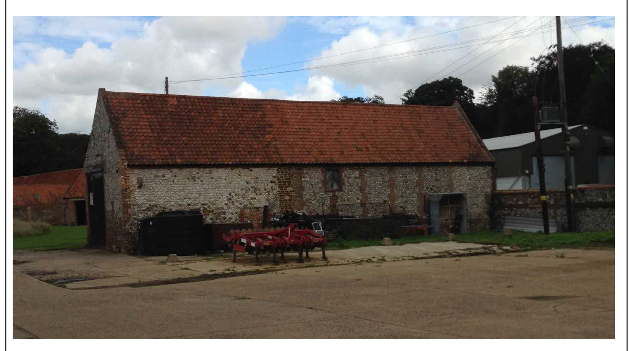
Below – Western Elevation