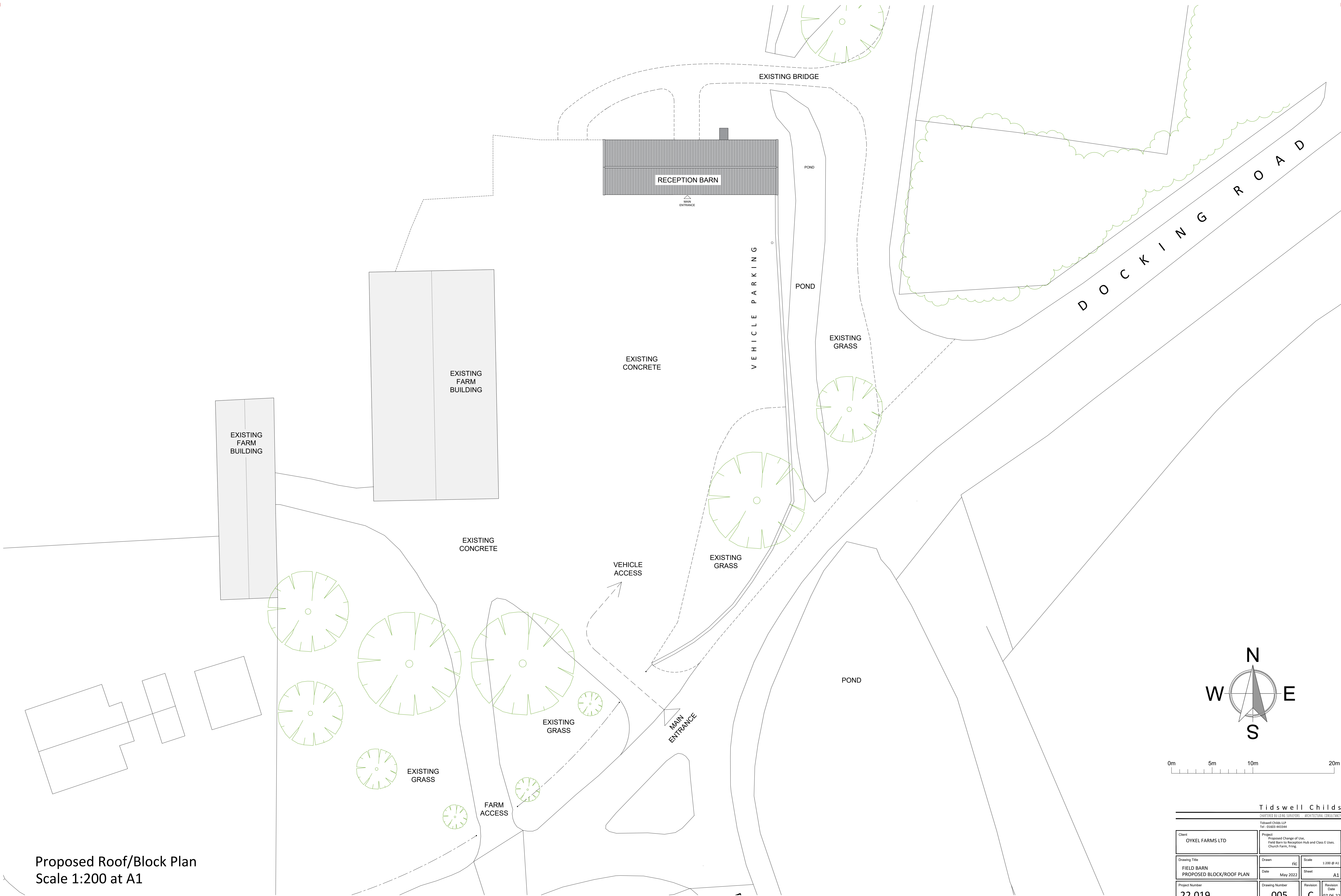
Proposed Roof/Block Plan Scale 1:200 at A1