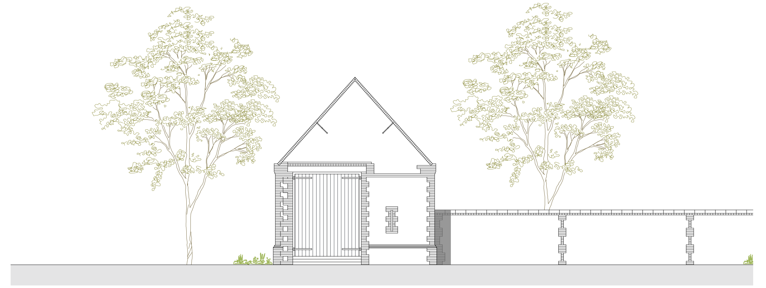
Existing West Elevation