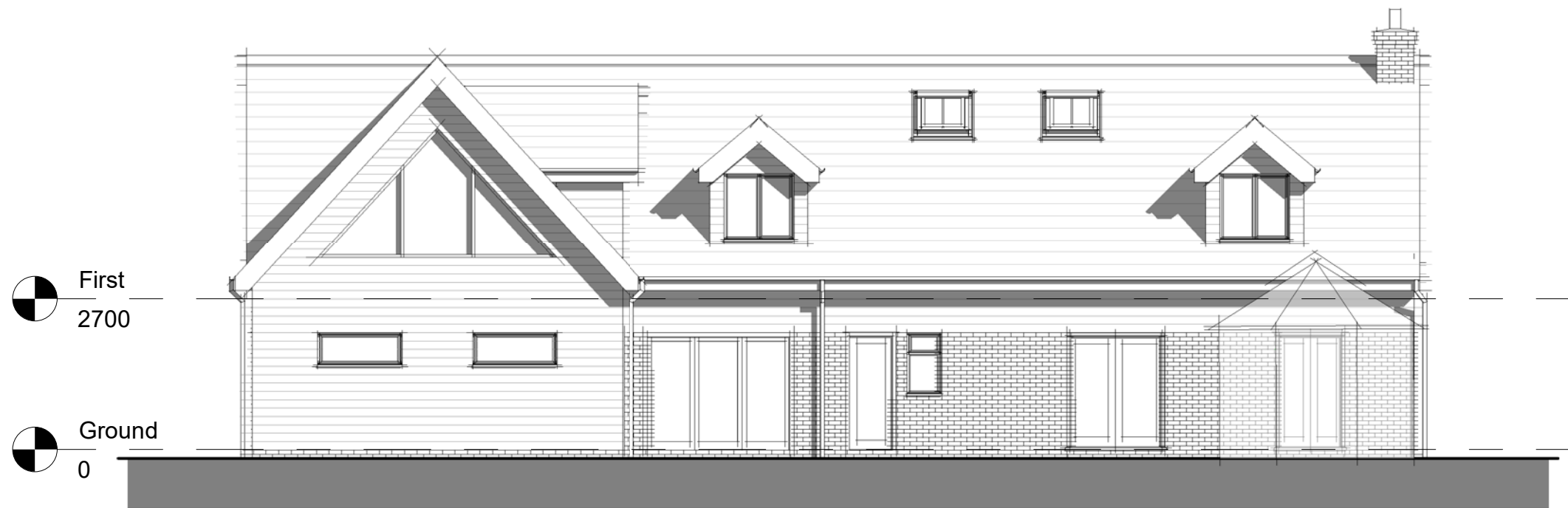
South-west 1 : 100