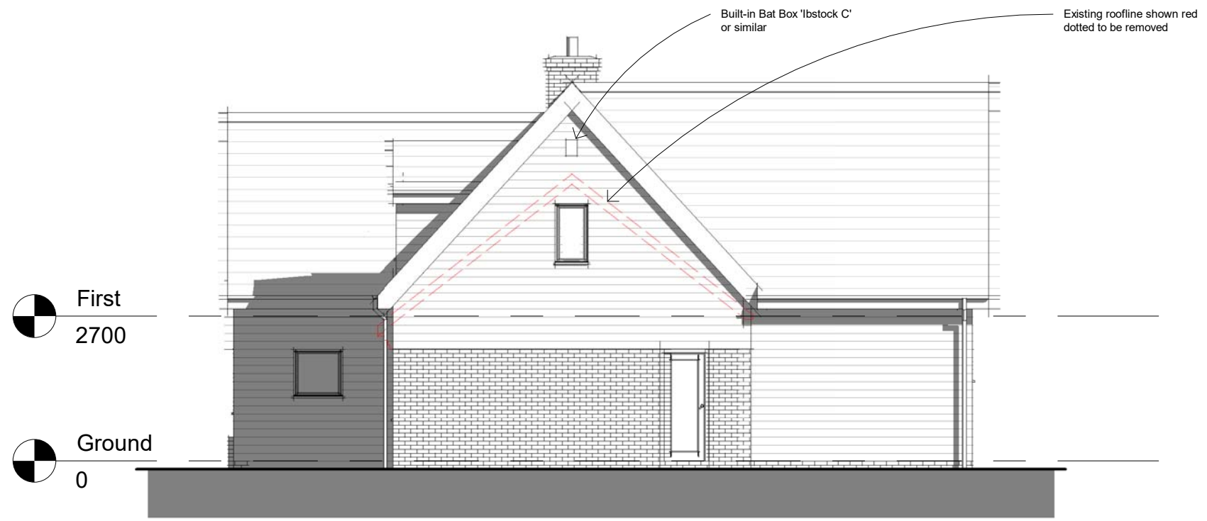
North-west 1 : 100