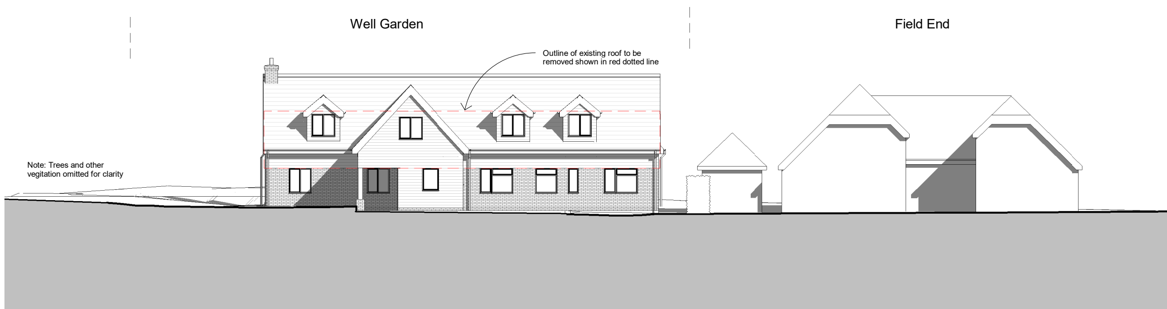
Proposed Streetscene 1 : 200

© The copyright of this drawing remains with Pro Vision and may not be reproduced in any form without prior written consent. Only scale from this drawing for the purposes of determining a planning application. Do not scale from this drawing for construction purposes. Any discrepancies between this and any other consultant's drawings should be reported to the Architect immediately. The contractor must check all dimensions before commencing work on site and all discrepancies reported to the Architect. No deviation from this drawing will be permitted without the prior consent of the Architect.