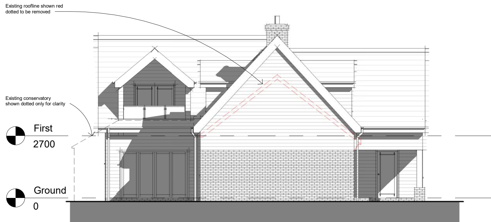
South-east 1 : 100

© The copyright of this drawing remains with Pro Vision and may not be reproduced in any form without prior written consent. Only scale from this drawing for the purposes of determining a planning application. Do not scale from this drawing for construction purposes. Any discrepancies between this and any other consultant's drawings should be reported to the Architect immediately. The contractor must check all dimensions before commencing work on site and all discrepancies reported to the Architect. No deviation from this drawing will be permitted without the prior consent of the Architect.