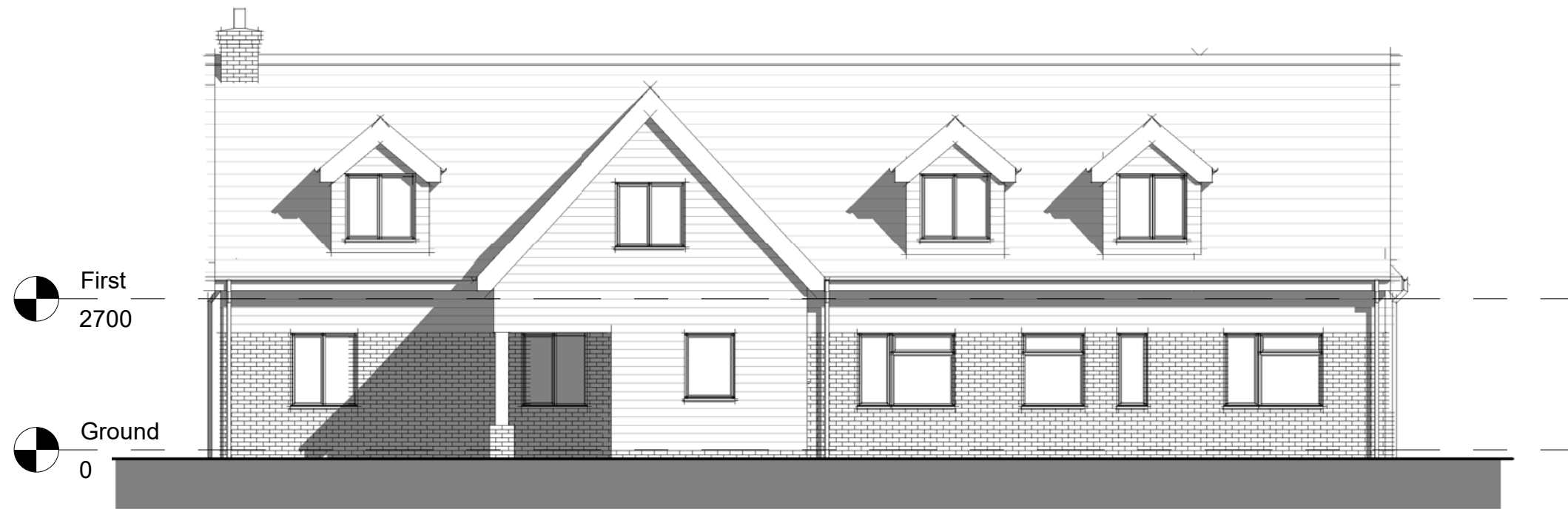
North-east 1 : 100