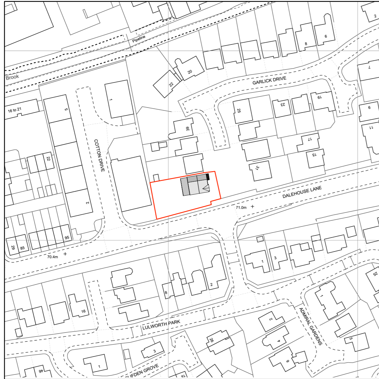
LOCATION PLAN Scale 1: 1250