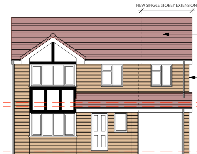
EAST ELEVATION Scale 1: 100

NEW TWO STOREY ROOF IN CONCRETE PAN TILED TO MATCH EXISTING MAIN HOUSE NEW TWO STOREY EXTENSION IN FACING BRICK TO MATCH EXISTING MAUN HOUSE