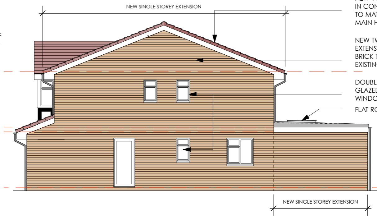
NORTH ELEVATION Scale 1: 100

NEW TWO STOREY ROOF IN CONCRETE PAN TILED TO MATCH EXISTING MAIN HOUSE NEW TWO STOREY EXTENSION IN FACING BRICK TO MATCH EXISTING MAUN HOUSE DOUBLE OBSCURE GLAZED UPVC FRAMED WINDOW FLAT ROOFLIGHT