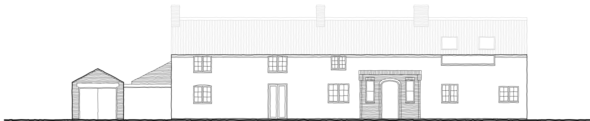
01 - ELEVATION SOUTH - EXISTING