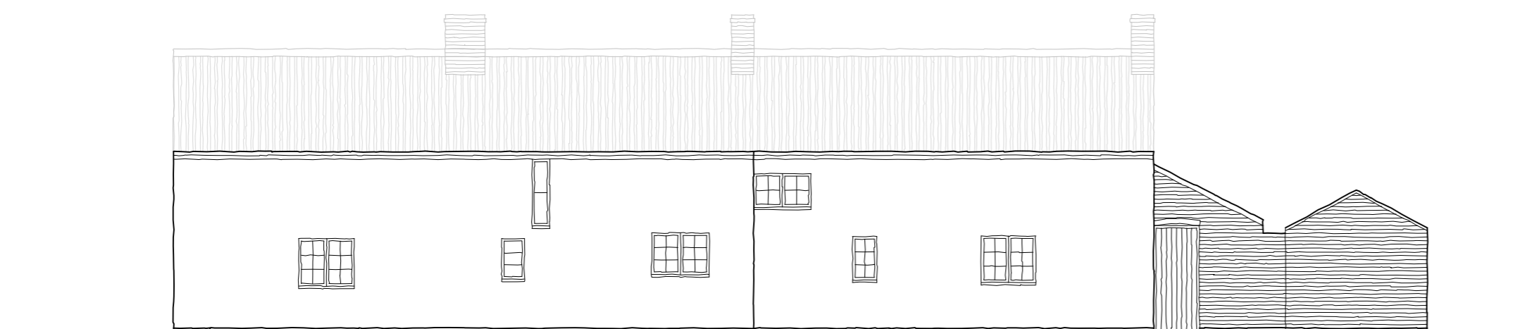
01 - ELEVATION NORTH - EXISTING