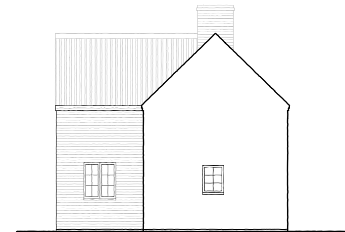
02 - ELEVATION EAST - EXISTING