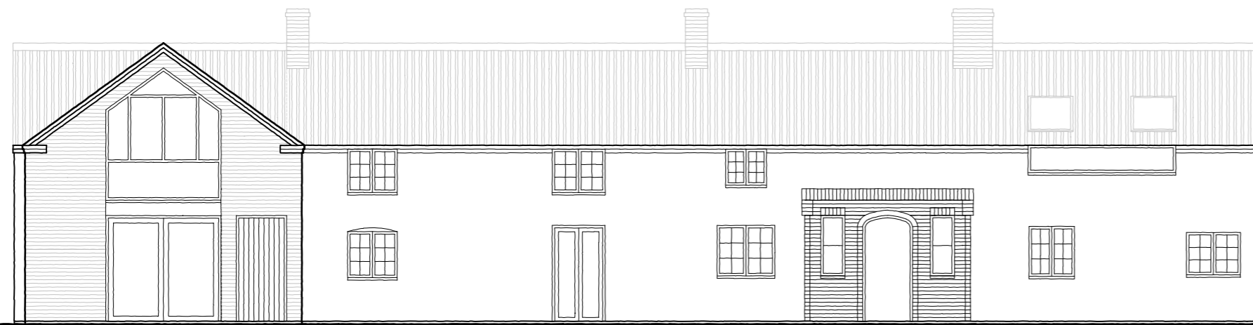
01 - ELEVATION SOUTH - EXISTING