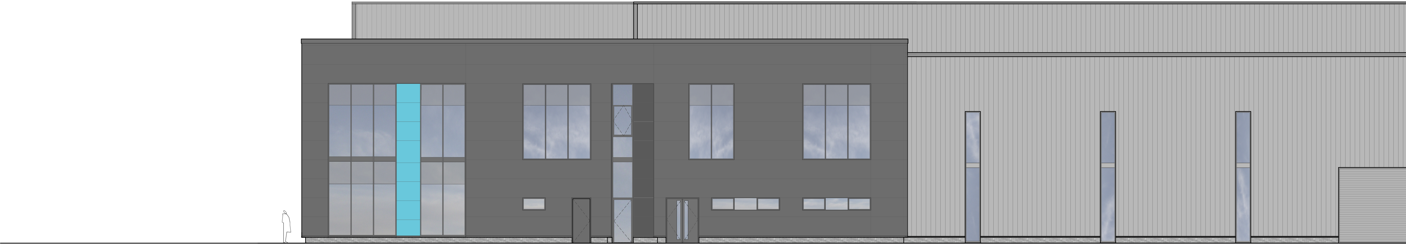
Proposed North-East Part Elevation- Showing Office