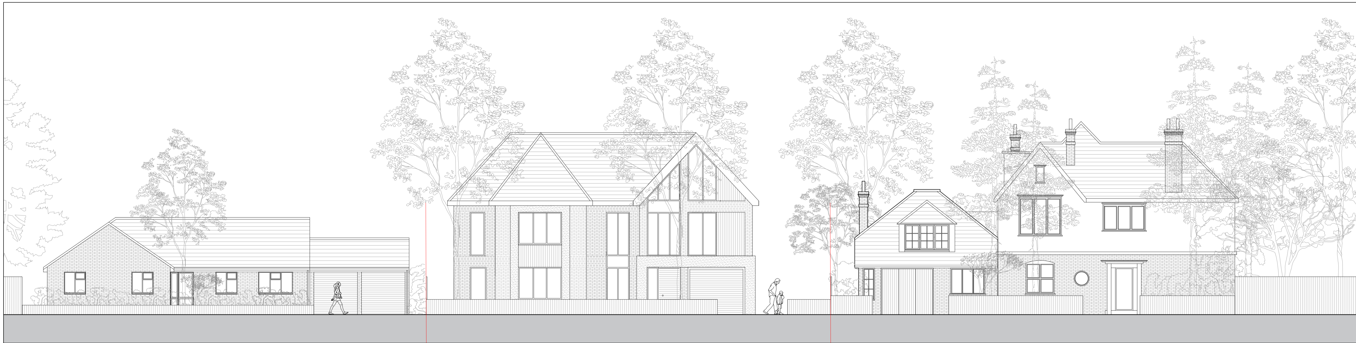
Proposed - Street Elevation