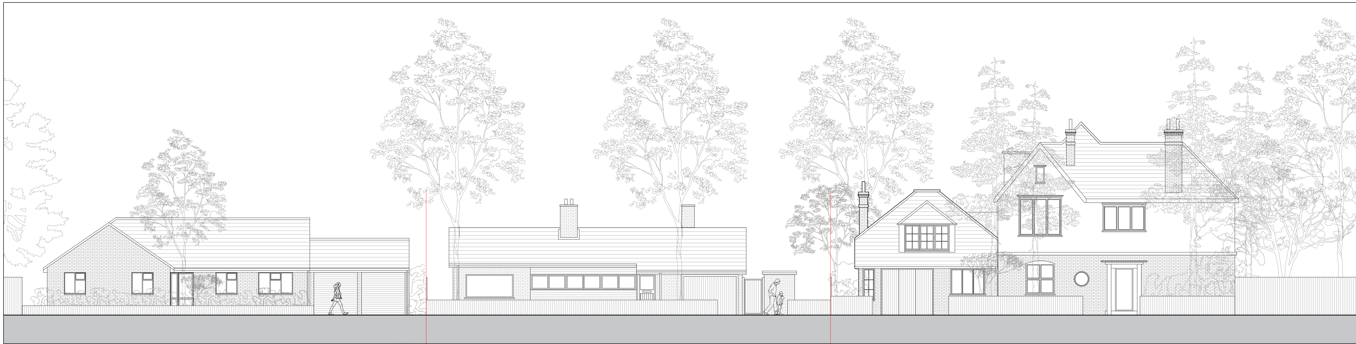
Existing - Street Elevation