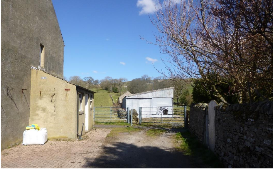
Fig 2: View to the east of no. 1 Nelson Row, showing field access gates and agricultural buildings.