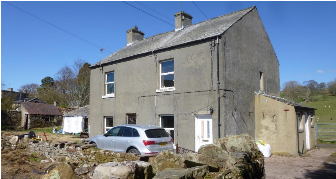
Fig 12: South elevation

There are matching modern single storey extensions (bathrooms) to the east and west of the buildings with monopitch roofs. Windows and doors are twentieth century and are generally UPVC, with some timber frames and doors. The two front doors have