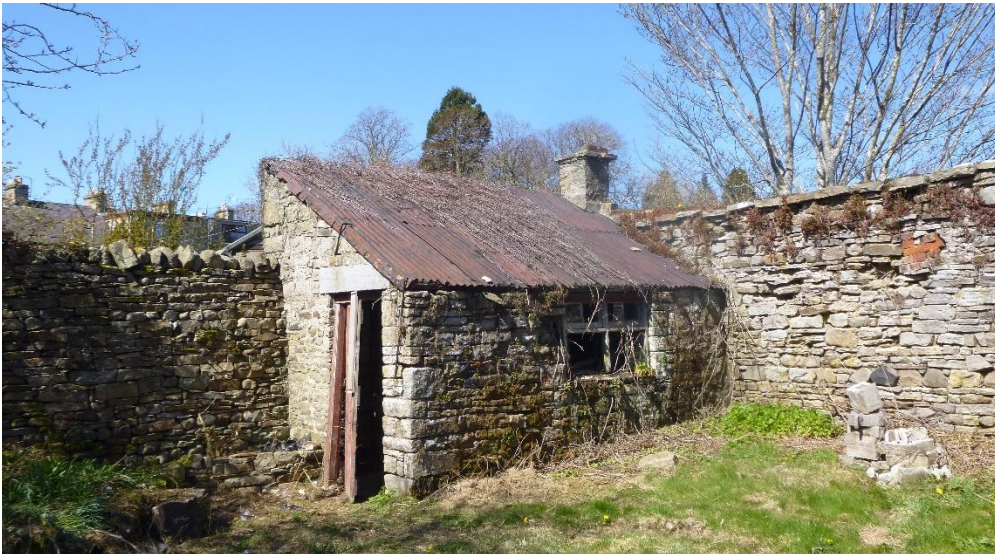
Fig 7: Existing stone outbuildings (washhouse) to northwest of site.