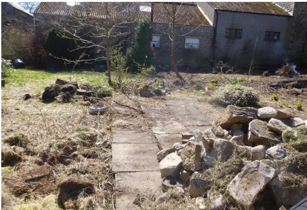
Fig 13: Existing site landscaping – modern concrete paving slabs. Industrial units behind.

The eastern boundary to the lane is a low stone wall, which has been altered and infilled over the years. Historic maps (circa.1895 to 1897) appear to show a range of outbuildings along this lane which may explain the infilled openings. The garden area to Nelson Row at this time appears to have been much larger - prior to the construction of the industrial units which seem to have been built between 1921 and 1977 – and laid out in a formal Parterre style. This seems to have been lost by 1897, presumably when the industrial units were built and in later map editions which show a number of outbuildings on the reduced area of land. There is no sign of any formal gardens at this time and any landscaping uncovered when clearing the site of undergrowth was twentieth century. Refer to figure 13 below.