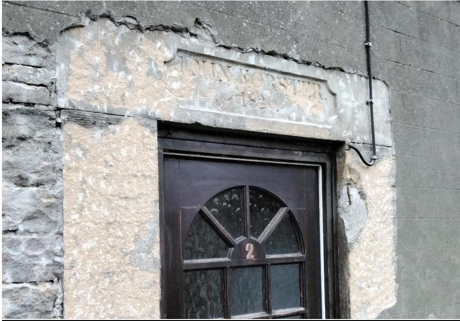
Fig 11: Existing stone door head with inscription to 'John Forster 1829'

there are twin chimney stacks, one to the west gable and one to the centre of the plan. Unusually, the frontage of the houses is not mirrored – instead they are a copy of each other, as with terraced properties.