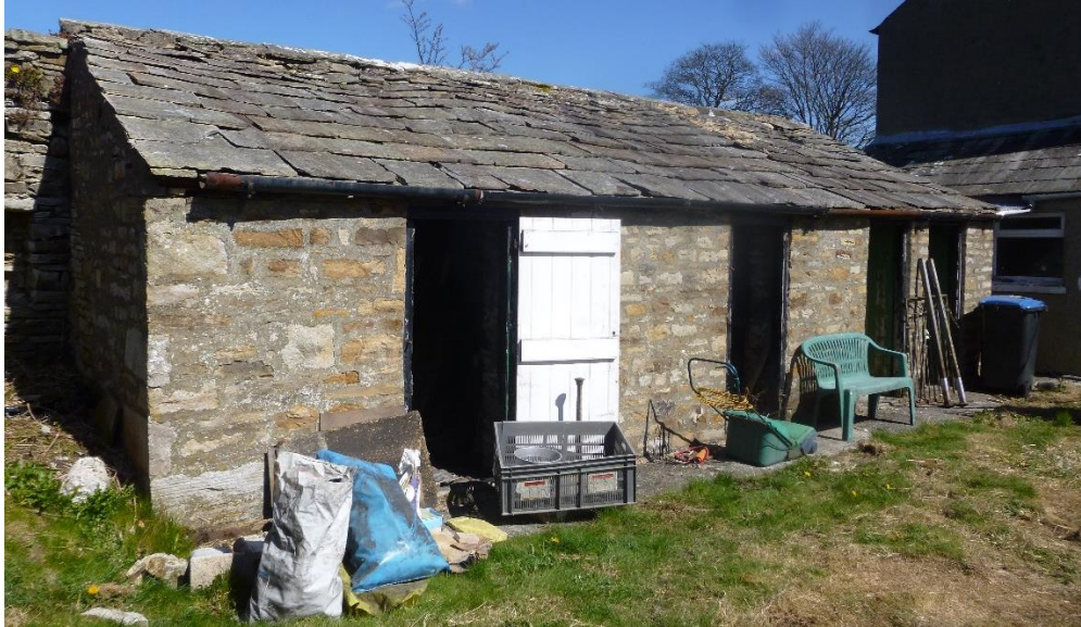
Fig 8: Existing stone outbuildings (stores and outside WC's) to northwest of site.