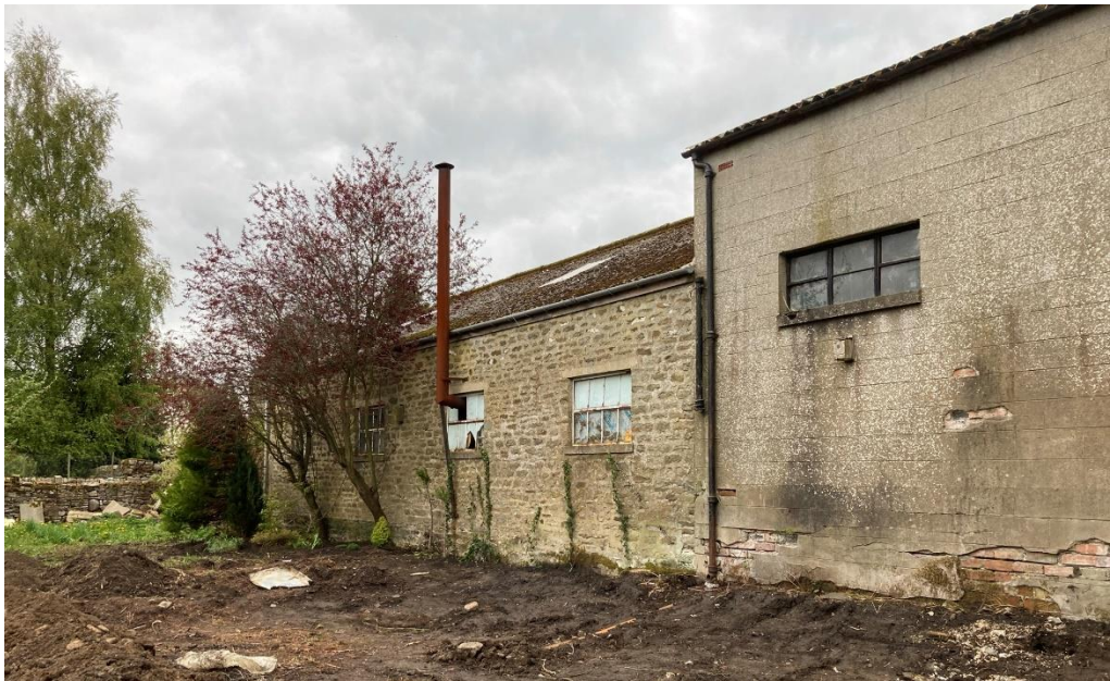
Fig 5: Industrial units to southern boundary of site