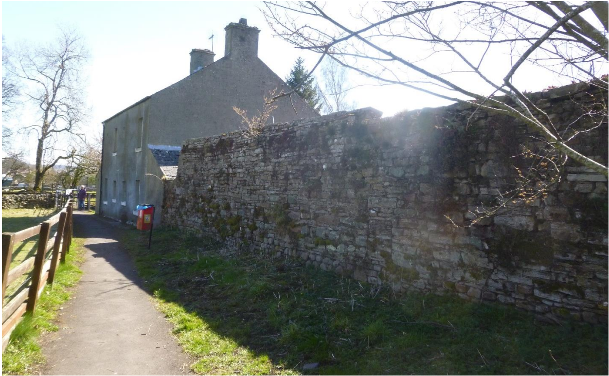
Fig 4: View to the north of Nelson Row, showing Public Footpath. Grassed area shown, to north of stone boundary wall is also owned by the applicant.