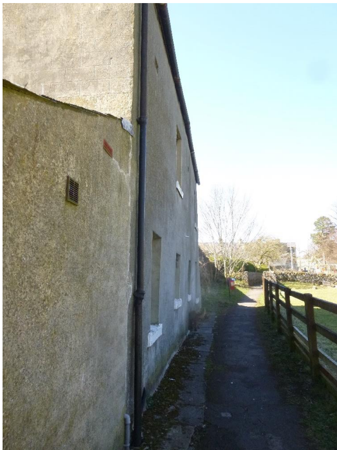
Fig 3: View to the north of Nelson Row, showing Public Footpath and field boundary to right of picture