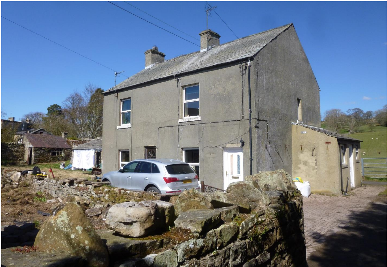
Fig 1: 1 and 2 Nelson Row, Middleton-in-Teesdale. South elevation from lane, showing outbuildings to left of picture.

Due to the difficulties imposed by Covid 19 which may make a site visit difficult to arrange, we include the following photographs of the existing building for reference.