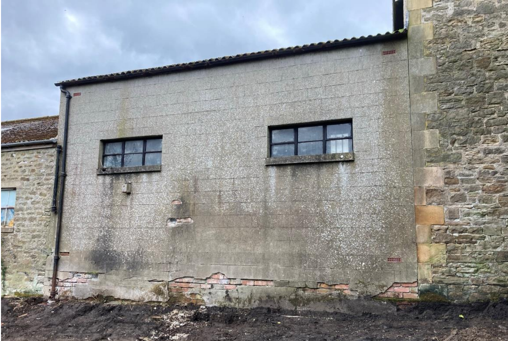
Fig 6: Industrial units to southern boundary of site