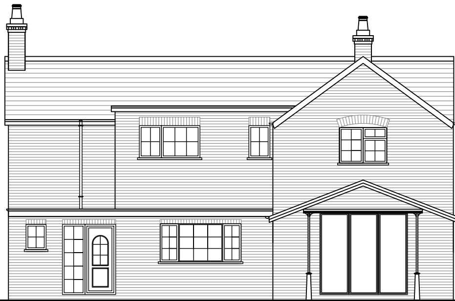
EXISTING NORTH WEST ELEVATION