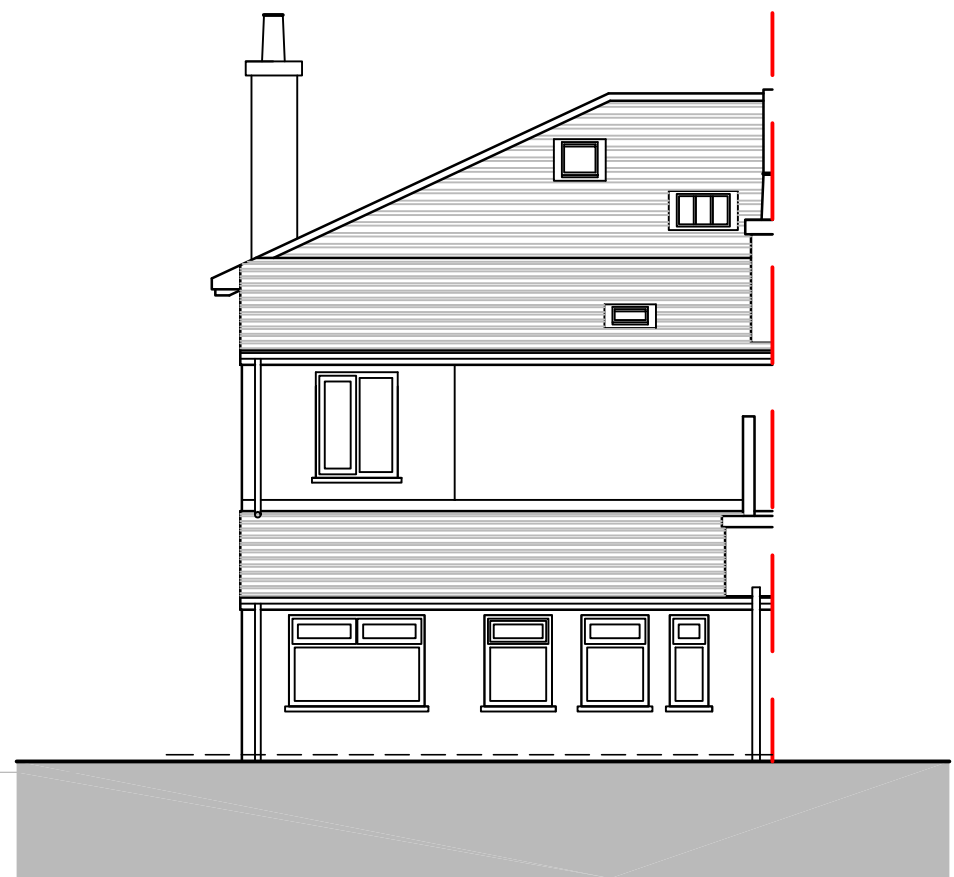
EXISTING REAR ELEVATION SCALE @ 1:100