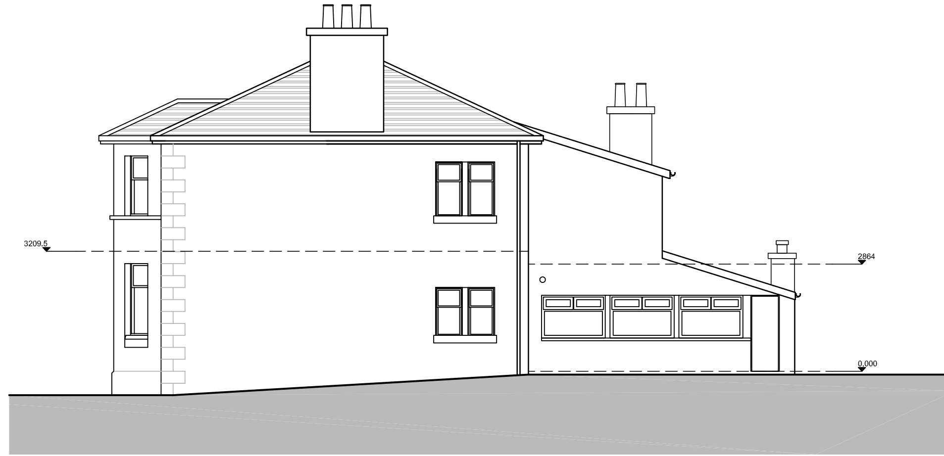
EXISTING SIDE ELEVATION SCALE @ 1:100