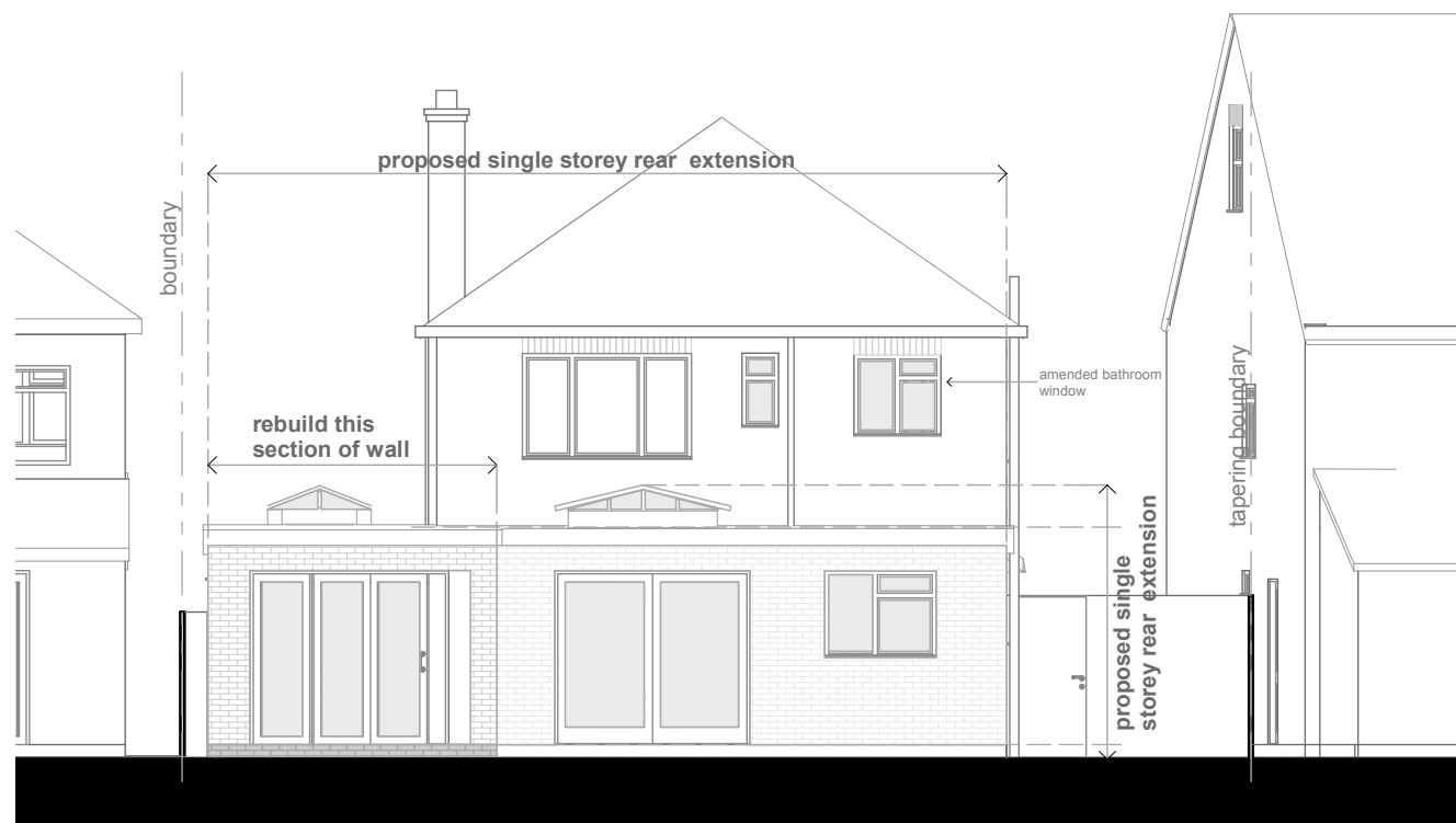
REAR (EAST) ELEVATION