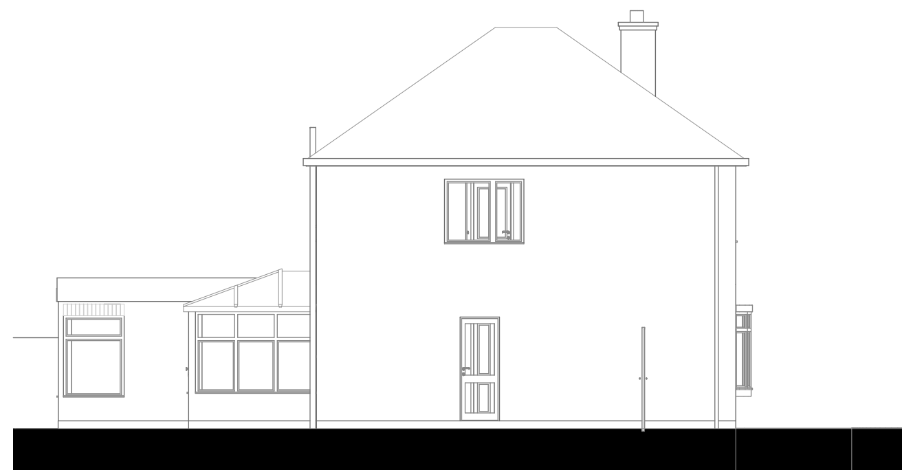
SIDE (NORTH) ELEVATION