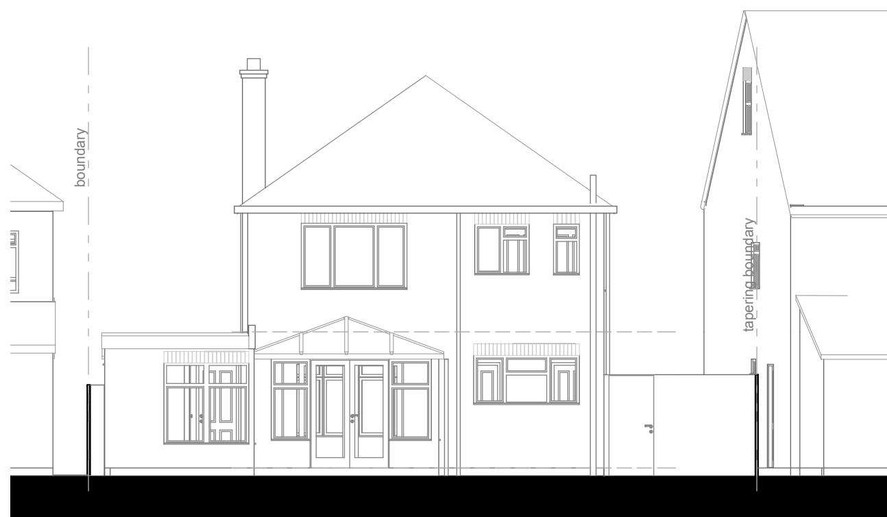
REAR (EAST) ELEVATION