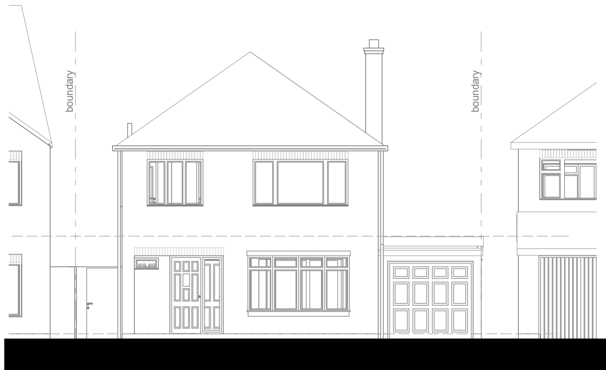
FRONT (WEST) ELEVATION