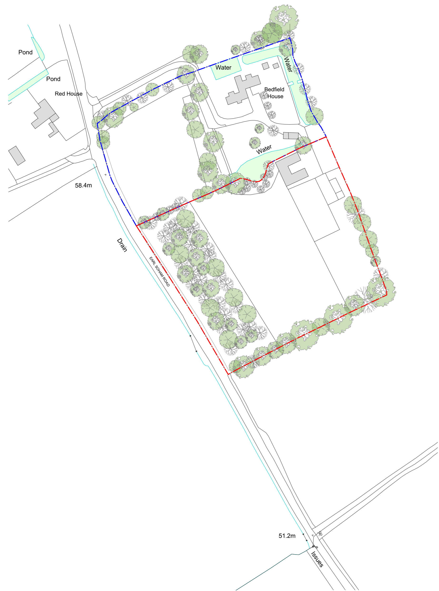
01 Site Location Plan S-01 Scale: 1:1250