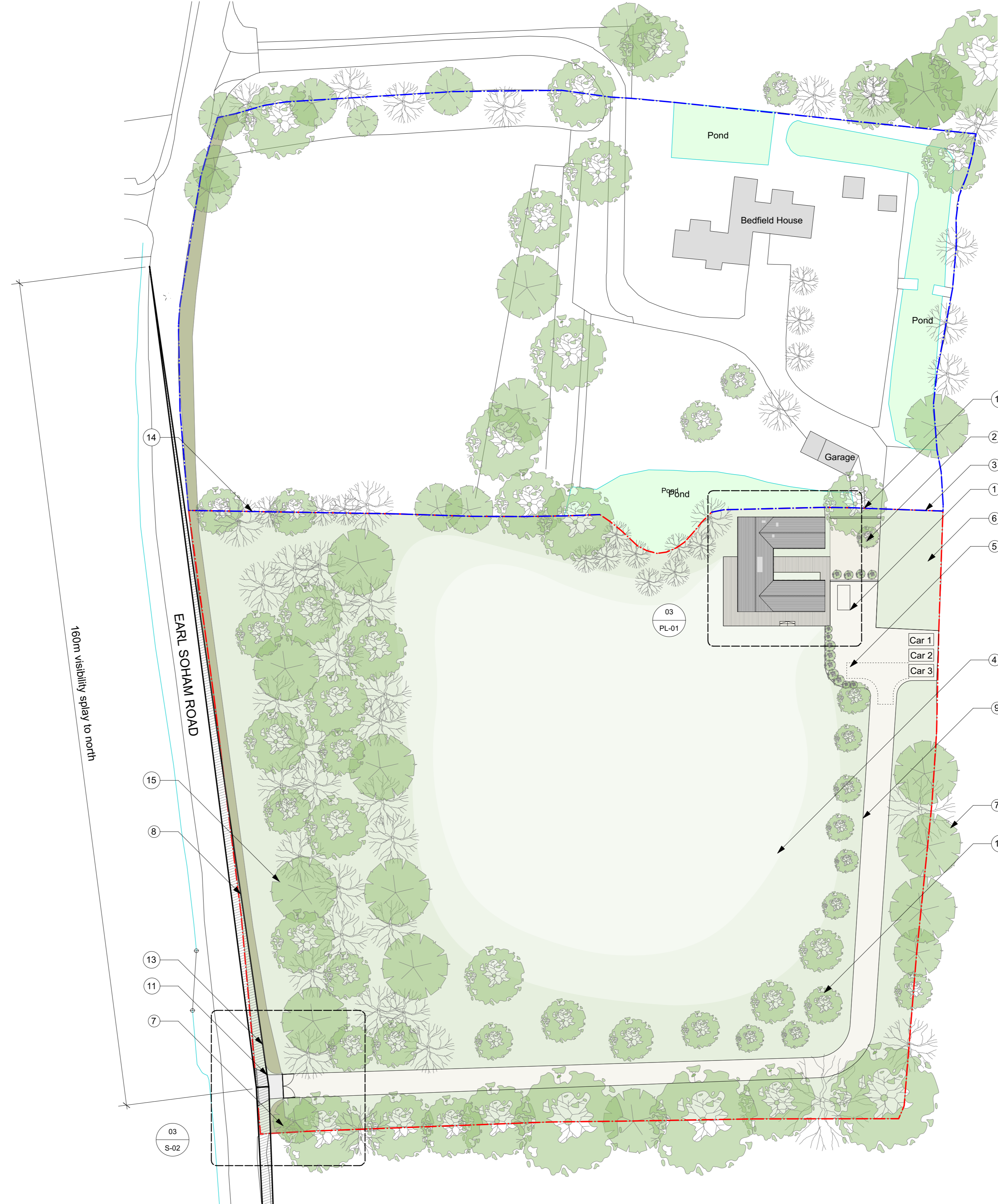
01 Site Plan as Proposed S-02 Scale: 1:500