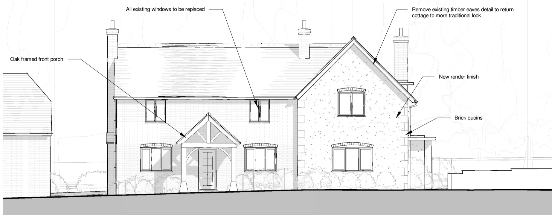
South Elevation 1 : 100