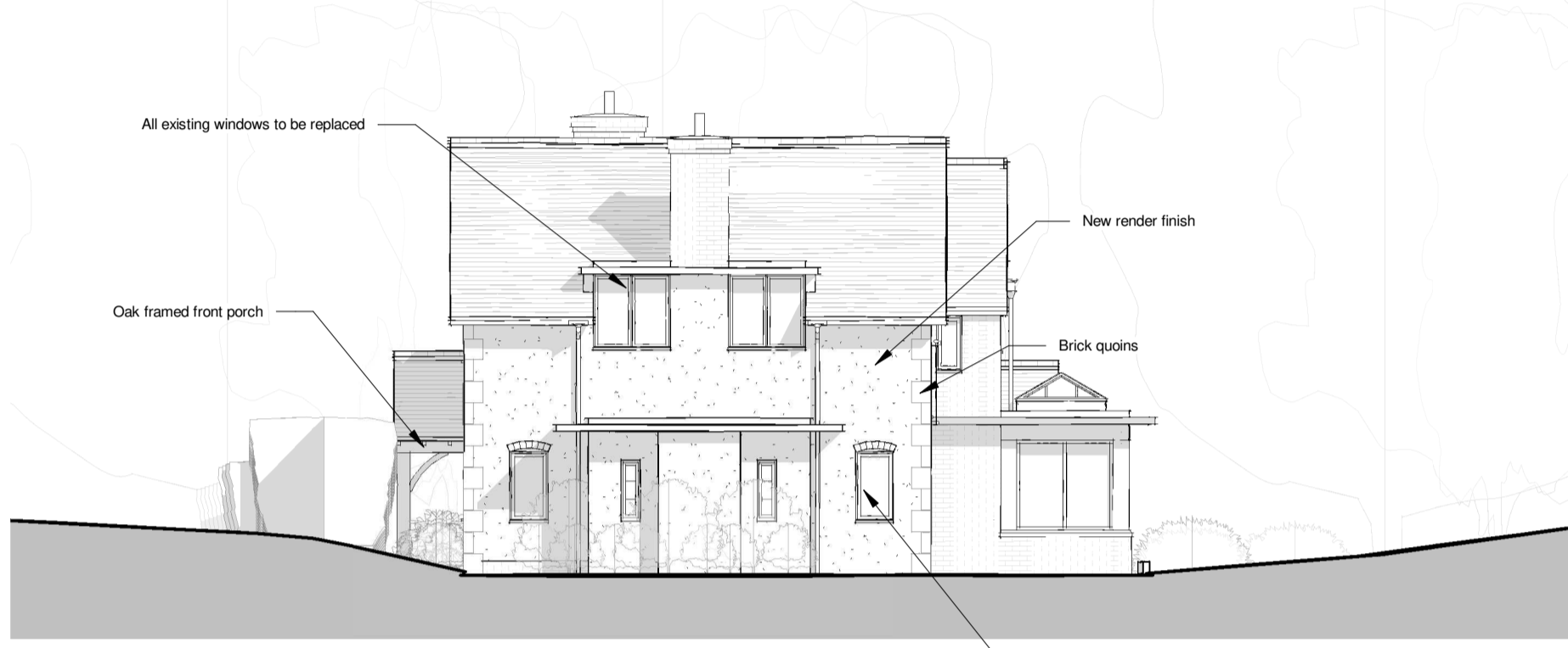
East Elevation 1 : 100