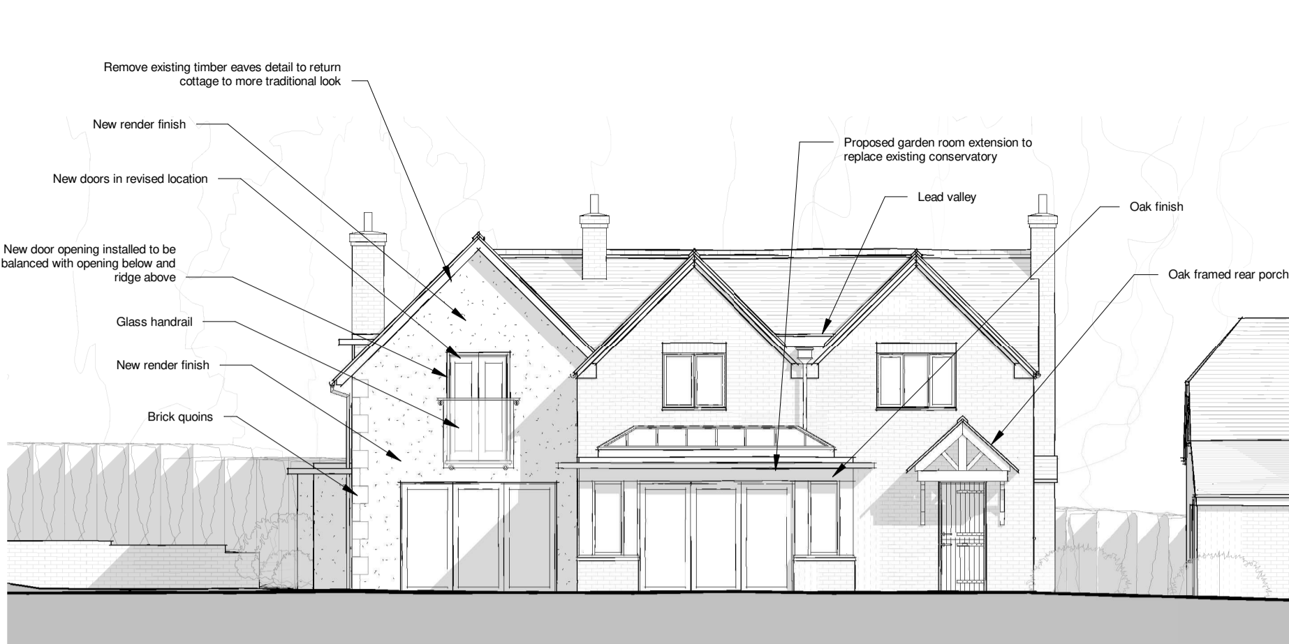
North Elevation 1 : 100