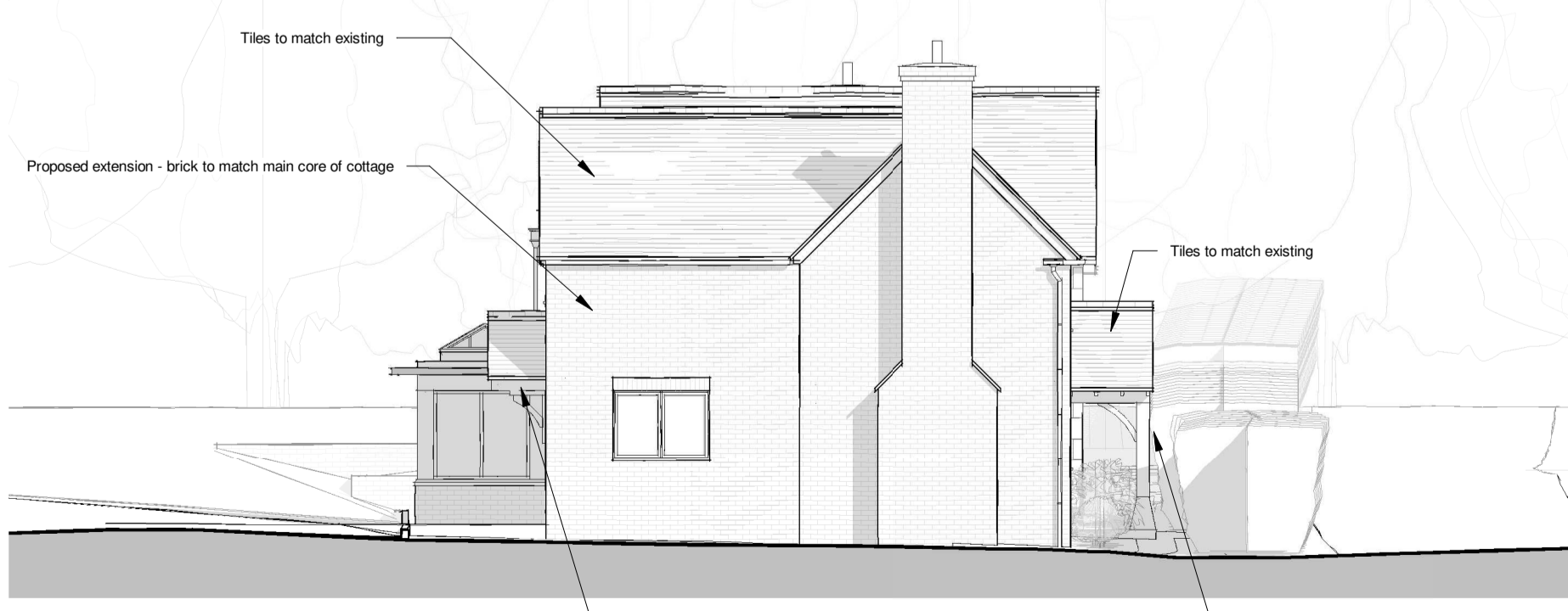
West Elevation 1 : 100