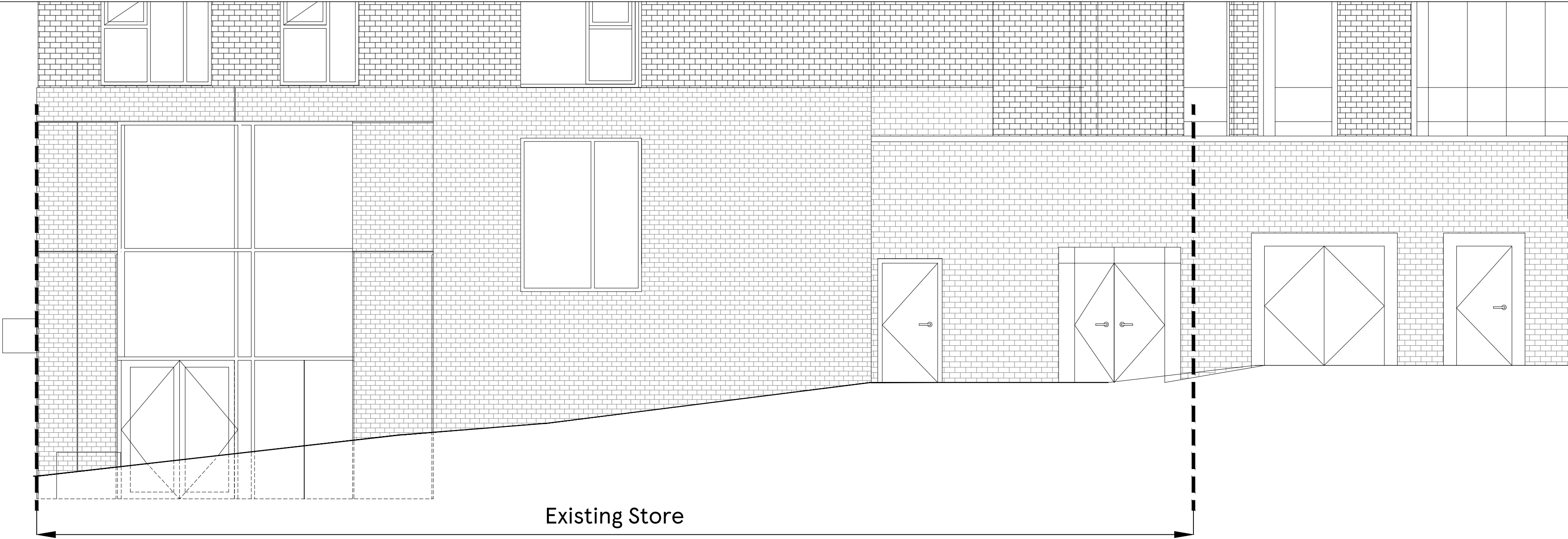
SOUTH ELEVATION WITH EXISTING STORE FRONTAGE