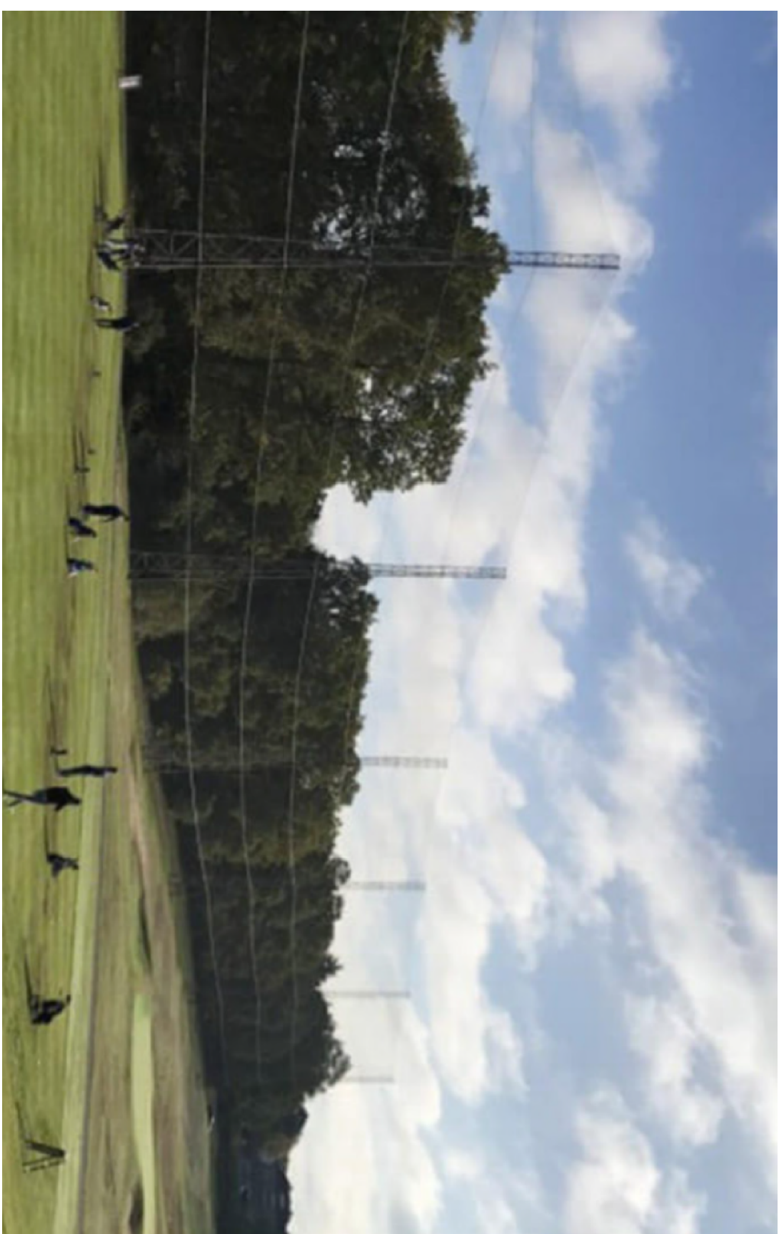
3 INDICATIVE IMAGE SCALE 1:500