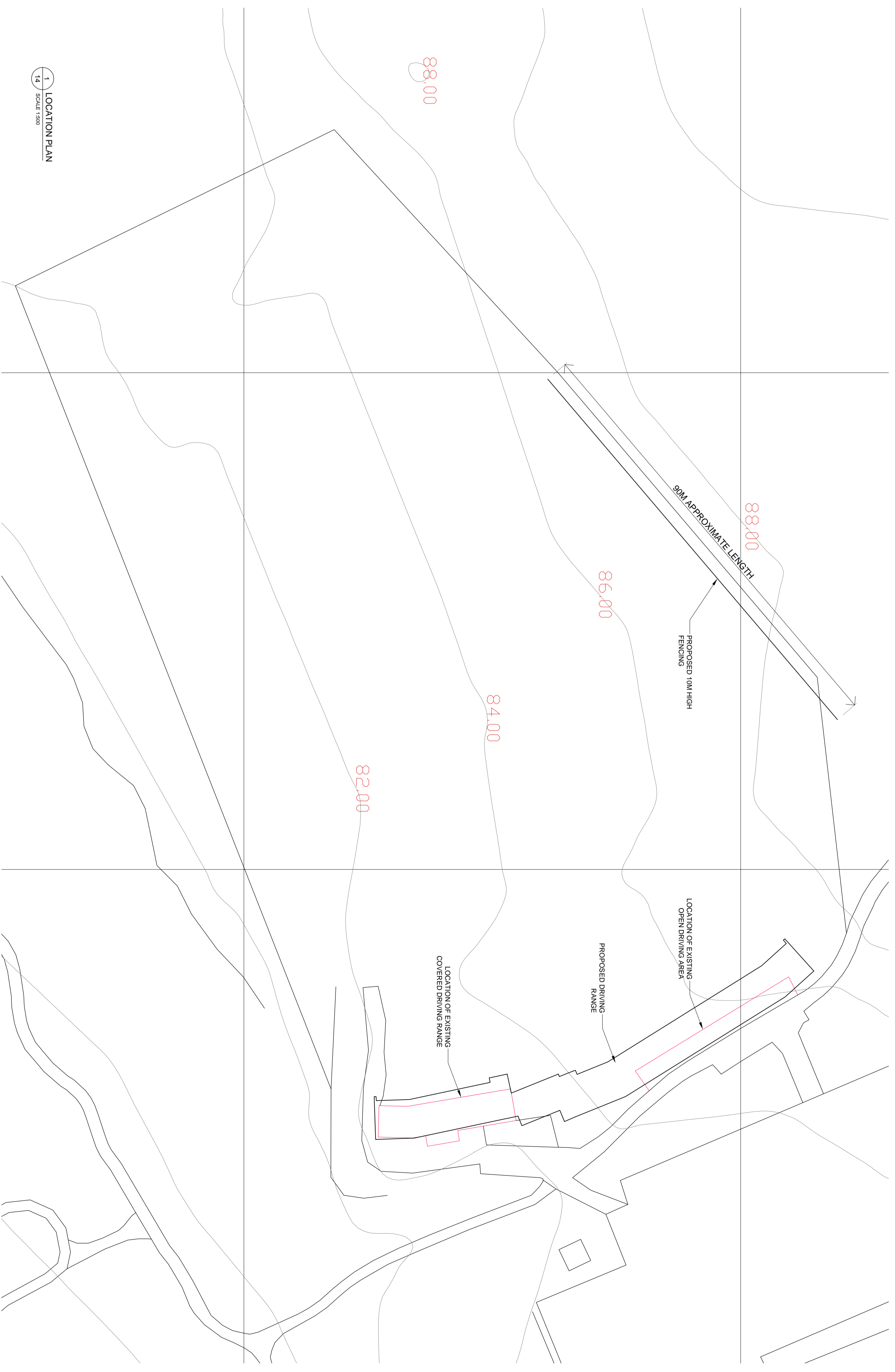
1 LOCATION PLAN SCALE 1:500