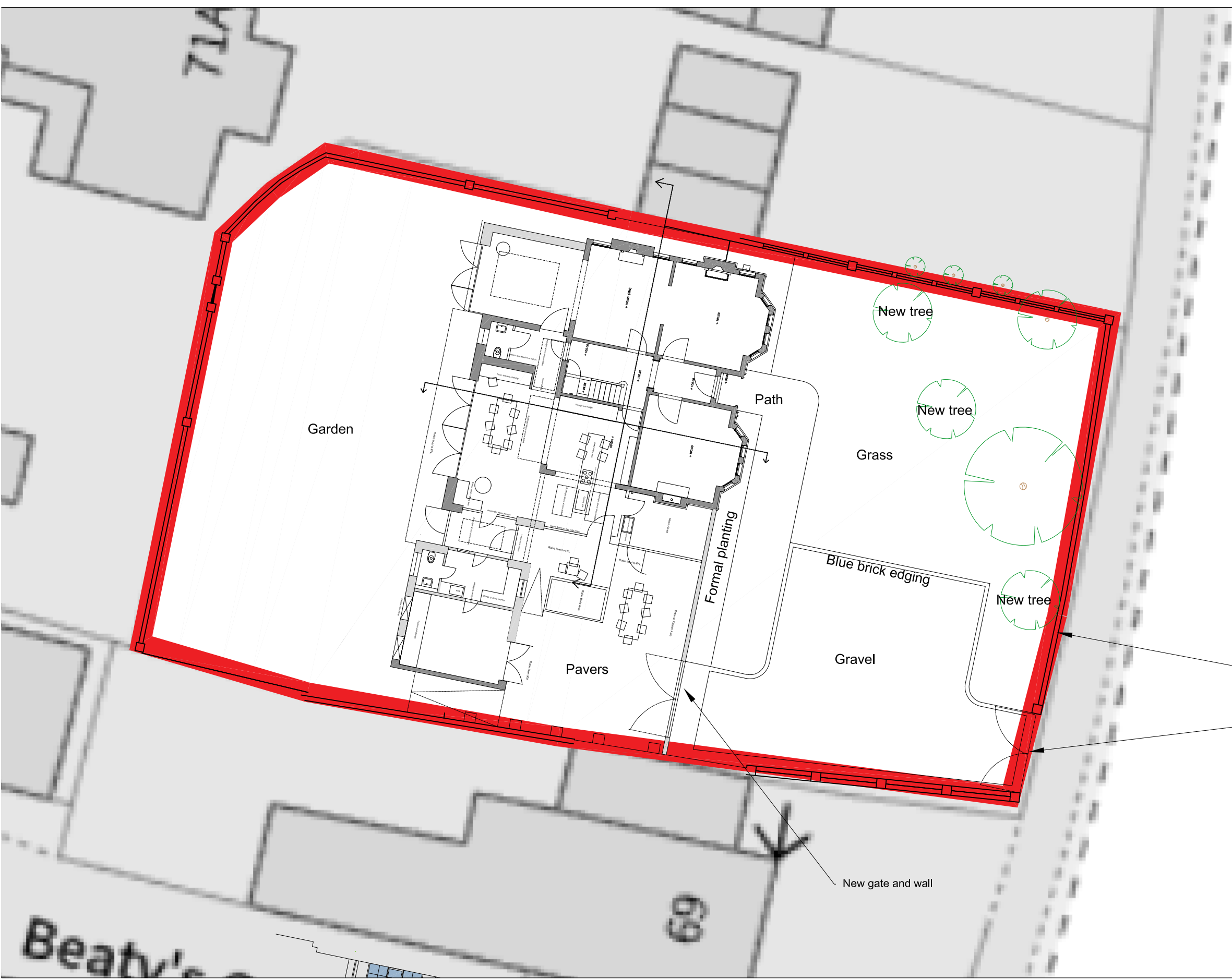
Proposed Site Plan 1:200