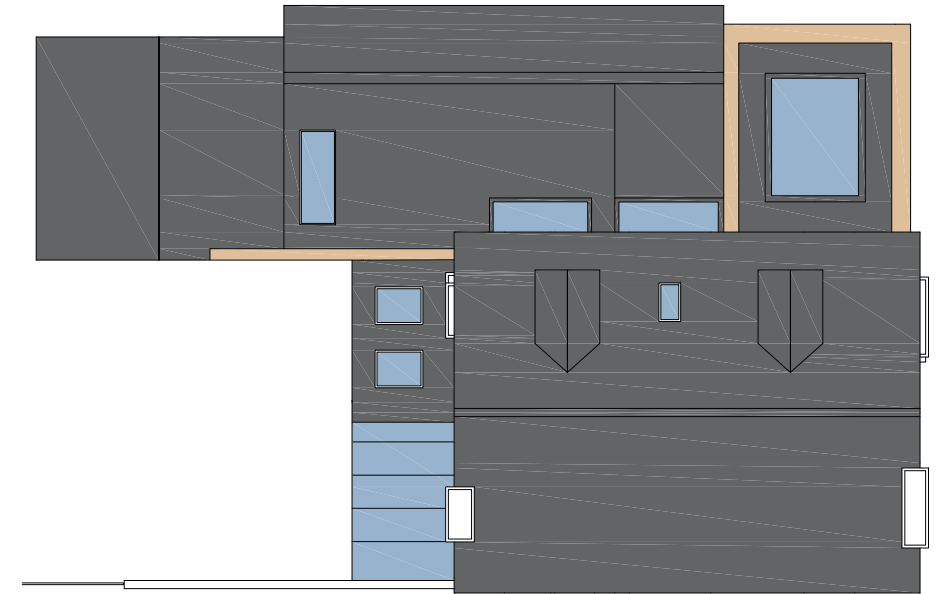
Proposed Roof Plan 1:200 @ A3