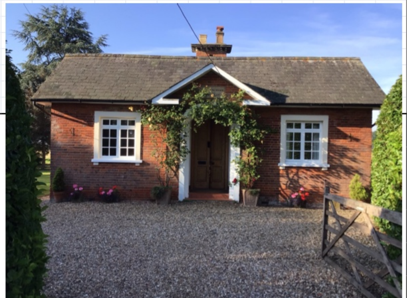
Front elevation of Main House