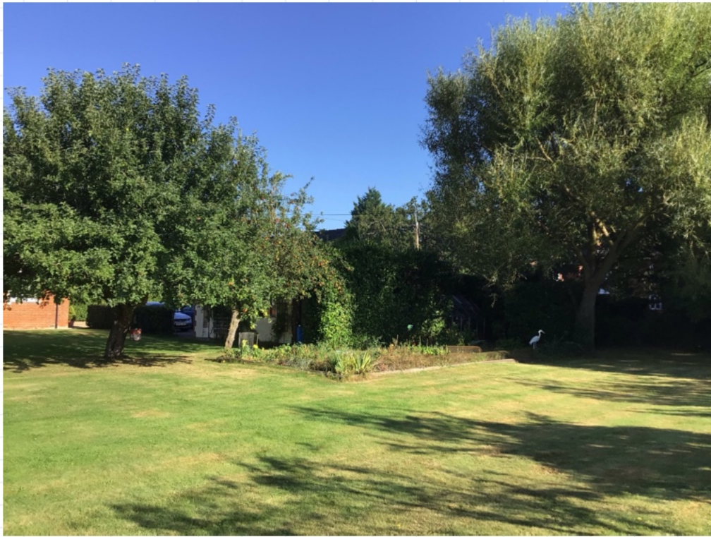
View from the rear

LOCATION: Vegetation adjacent to the garage