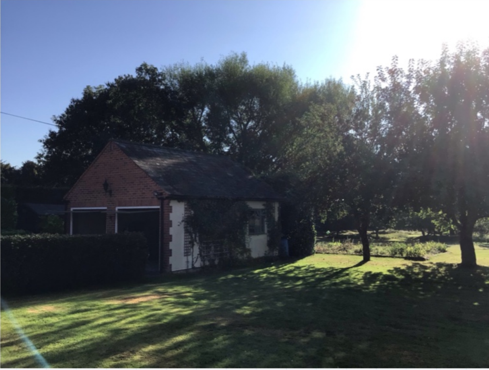
View from the front