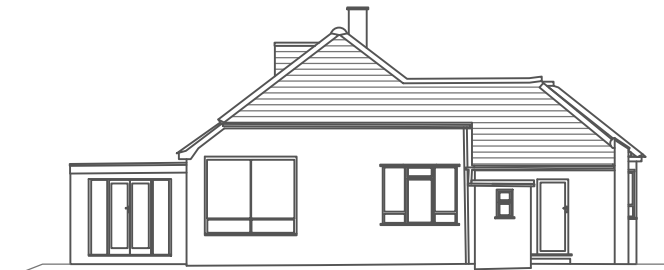
Existing South Elevation (Side) Scale 1:200 @ A3

HOOK SURVEY PARTNERSHIP Land & Building Surveyors www.hooksurvey.com