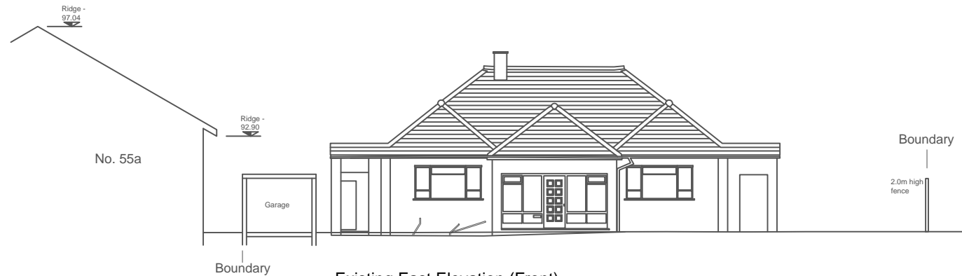
Existing East Elevation (Front) Scale 1:200 @ A3