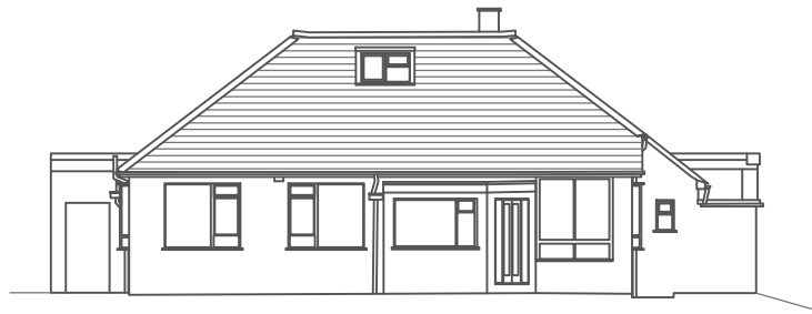
Existing West Elevation (Rear) Scale 1:200 @ A3