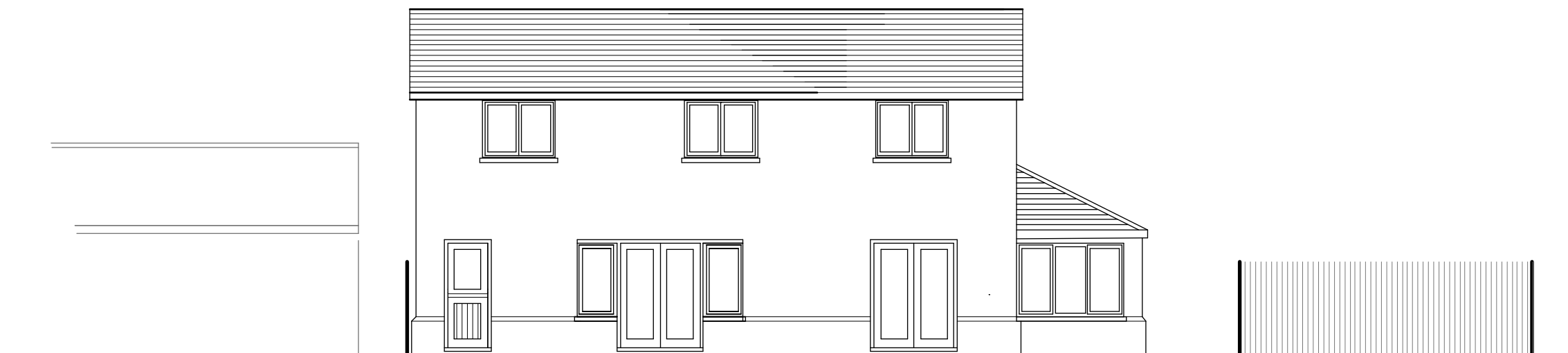
Proposed South West Elevation 1:100