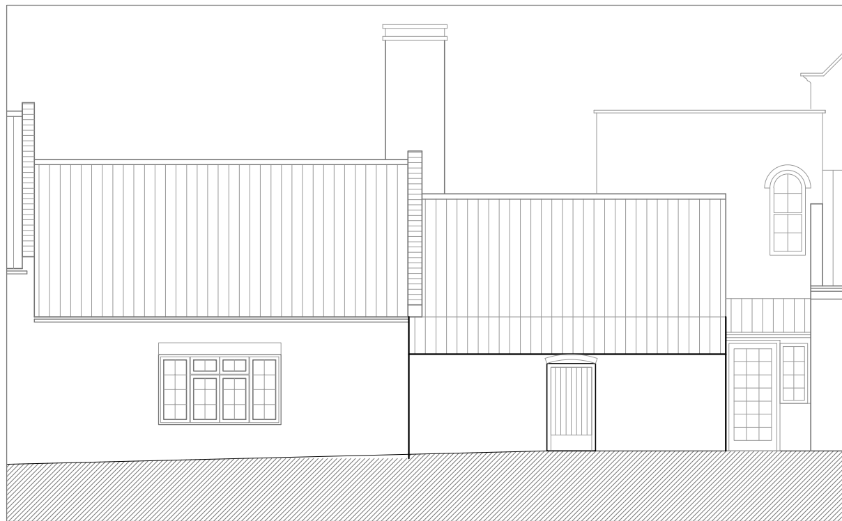
Existing West Elevation 1:100