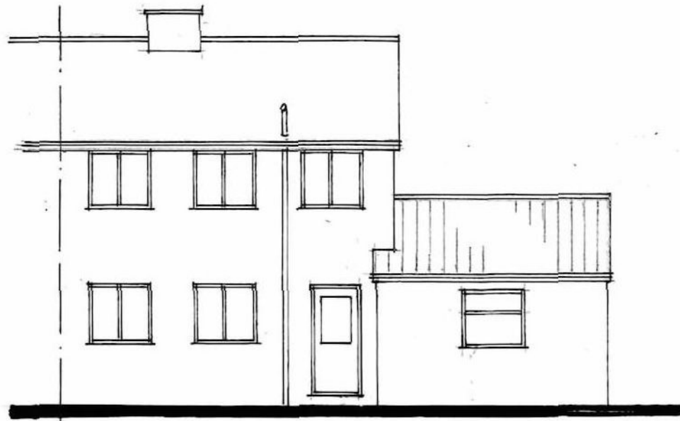
rear elevation east