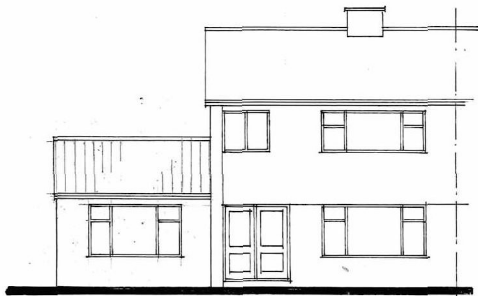
front elevation west