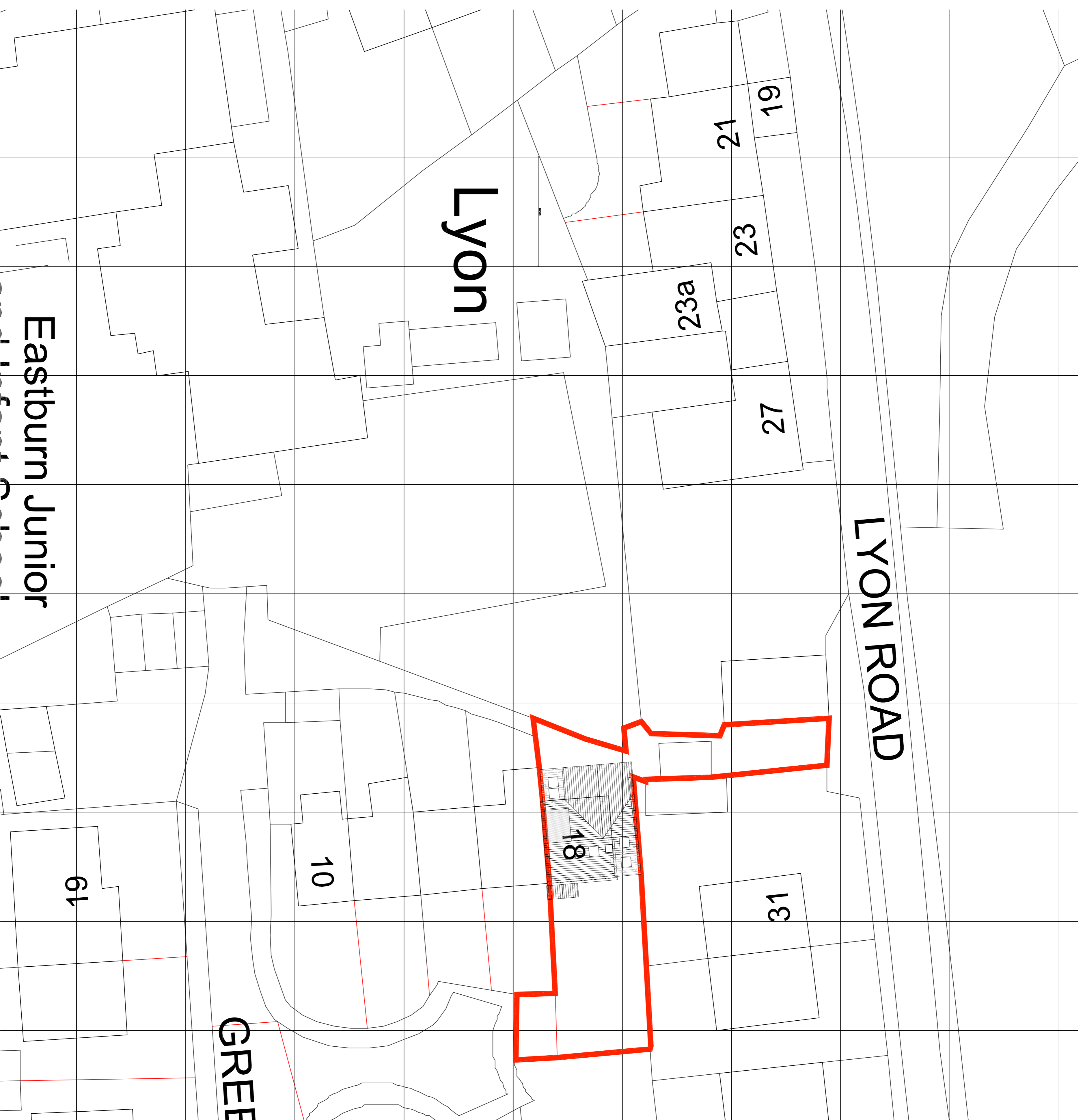
PROPOSED SITE PLAN SCALE 1:200 @ A1